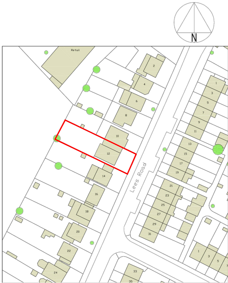
06 - OS MAP SCALE 1:1250