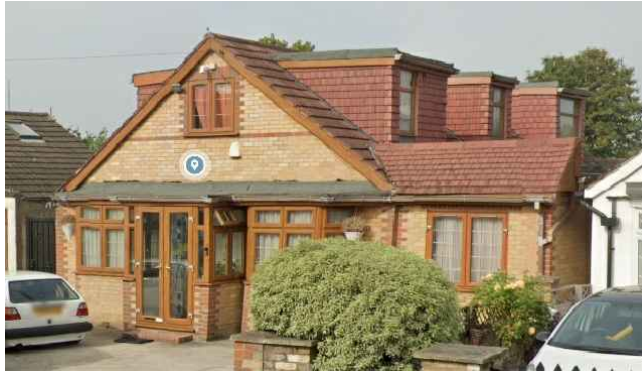
02 - SIDE VIEW