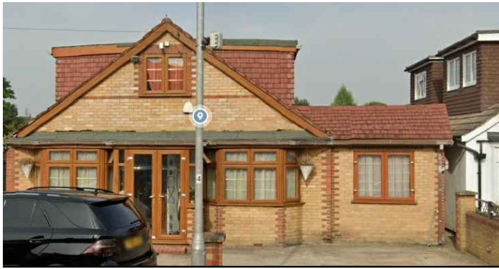
01 - FRONT VIEW