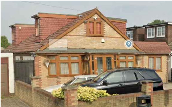
03 - SIDE VIEW