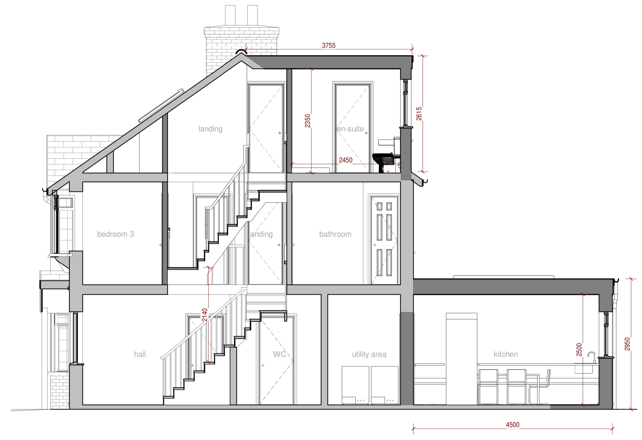
1 A-A SECTION 1:50