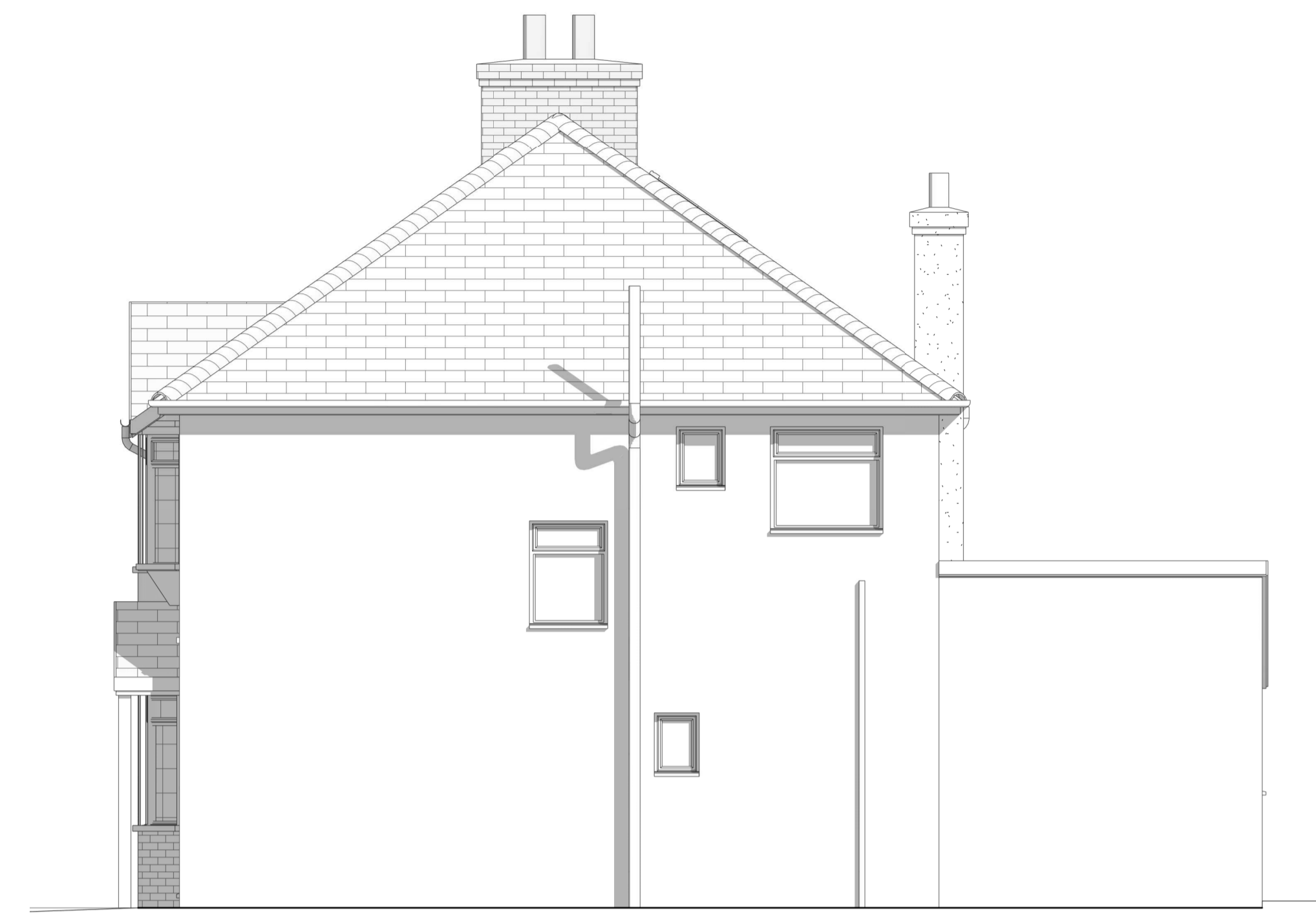
2 02 EXISTING SIDE ELEVATION 1:50