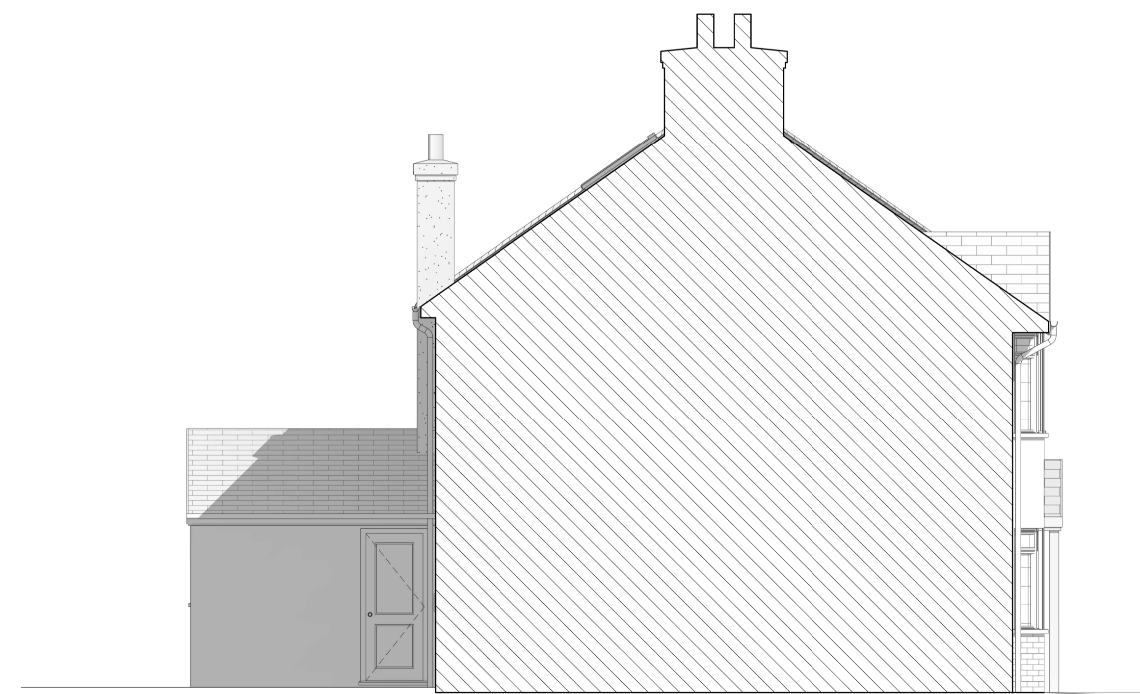
4 04 EXISTING SIDE ELEVATION 1:50