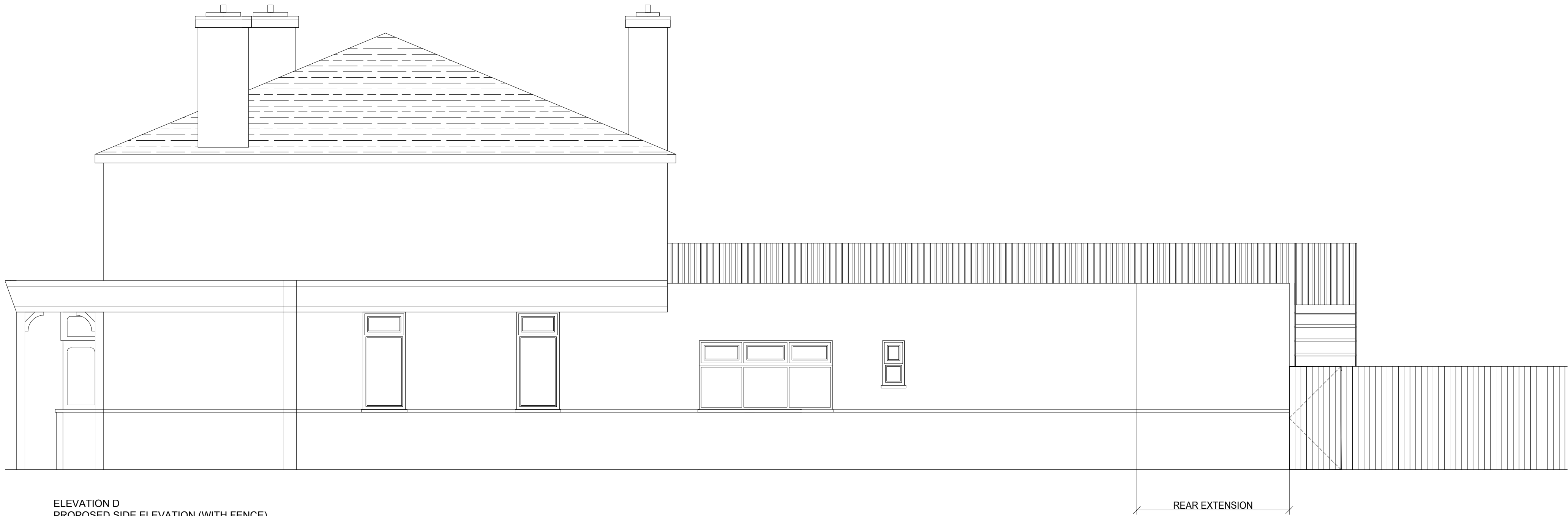
ELEVATION D PROPOSED SIDE ELEVATION (WITH FENCE)