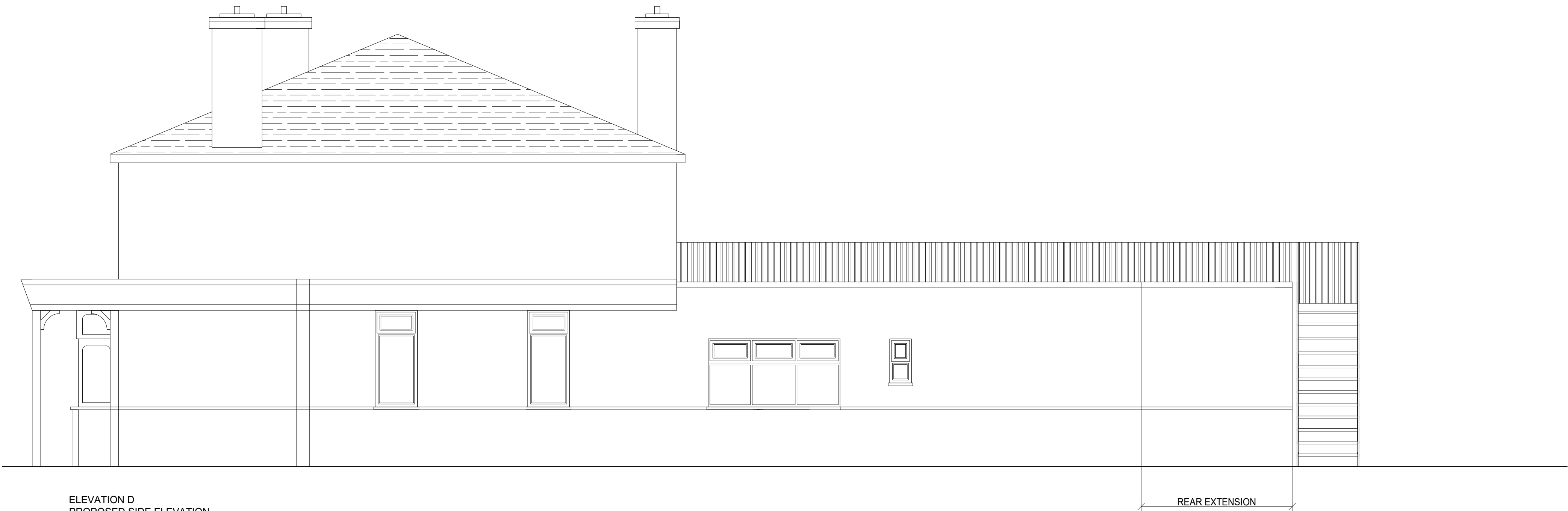
ELEVATION D PROPOSED SIDE ELEVATION