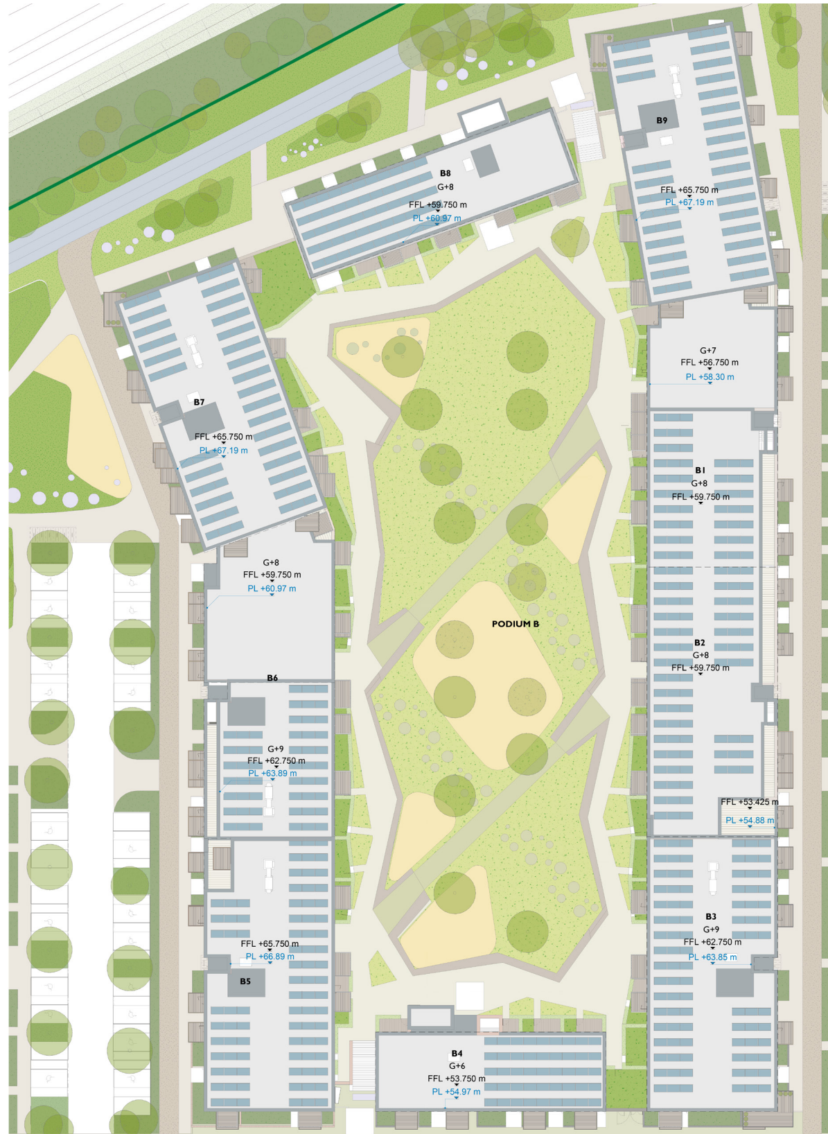
Consented Design - GA Roof Level