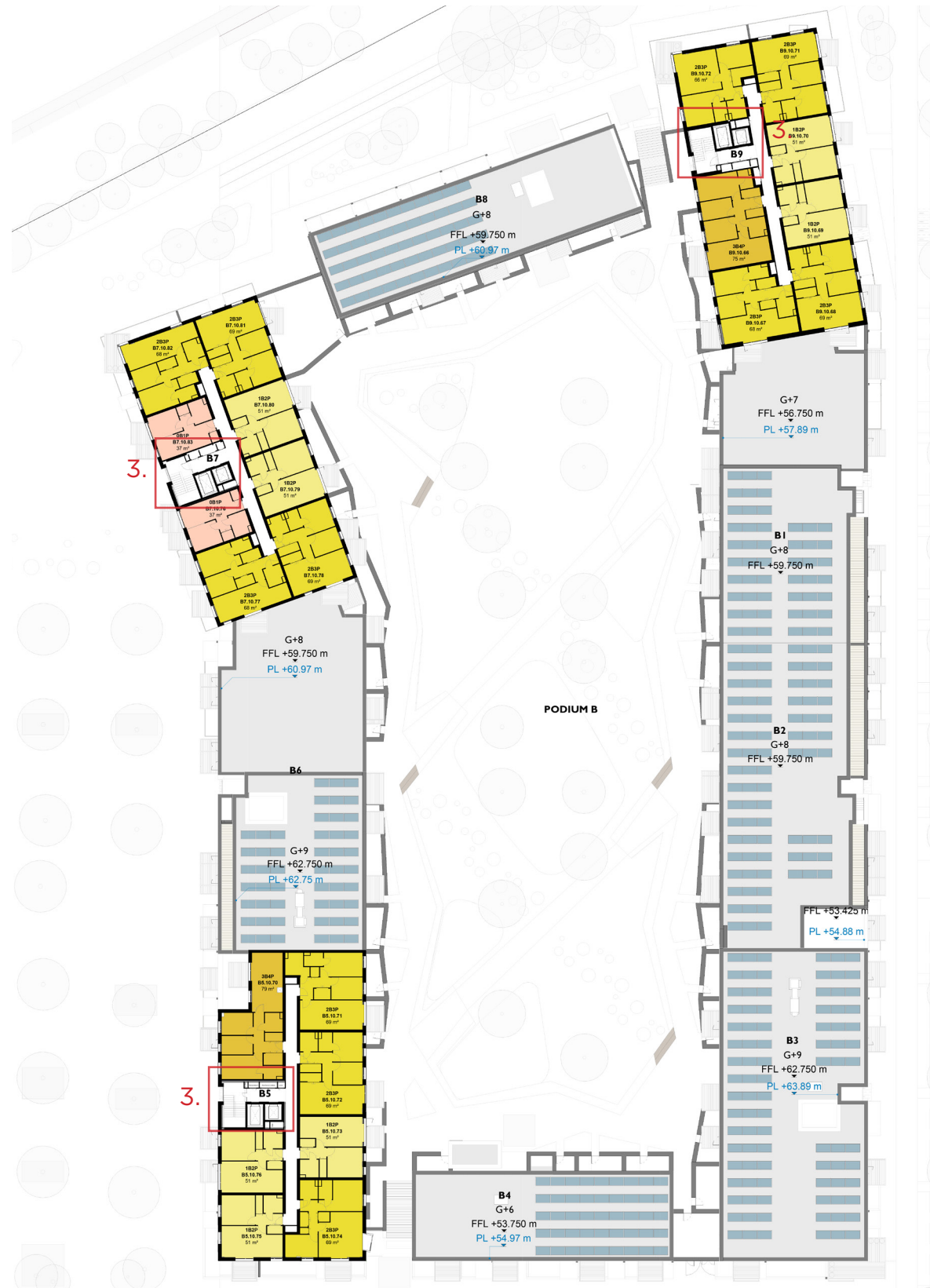
Consented Design - GA Level 10