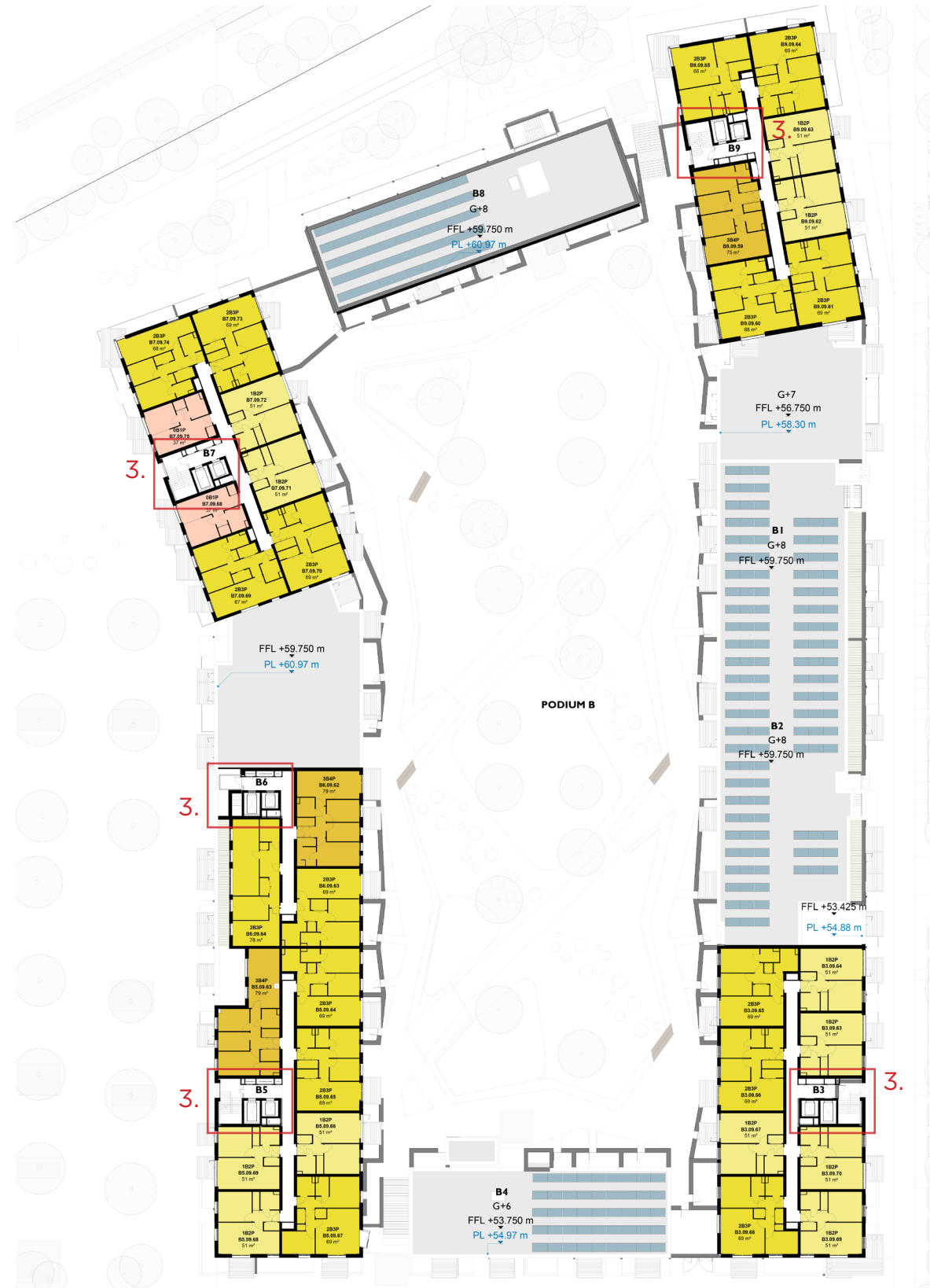
Consented Design - GA Level 09