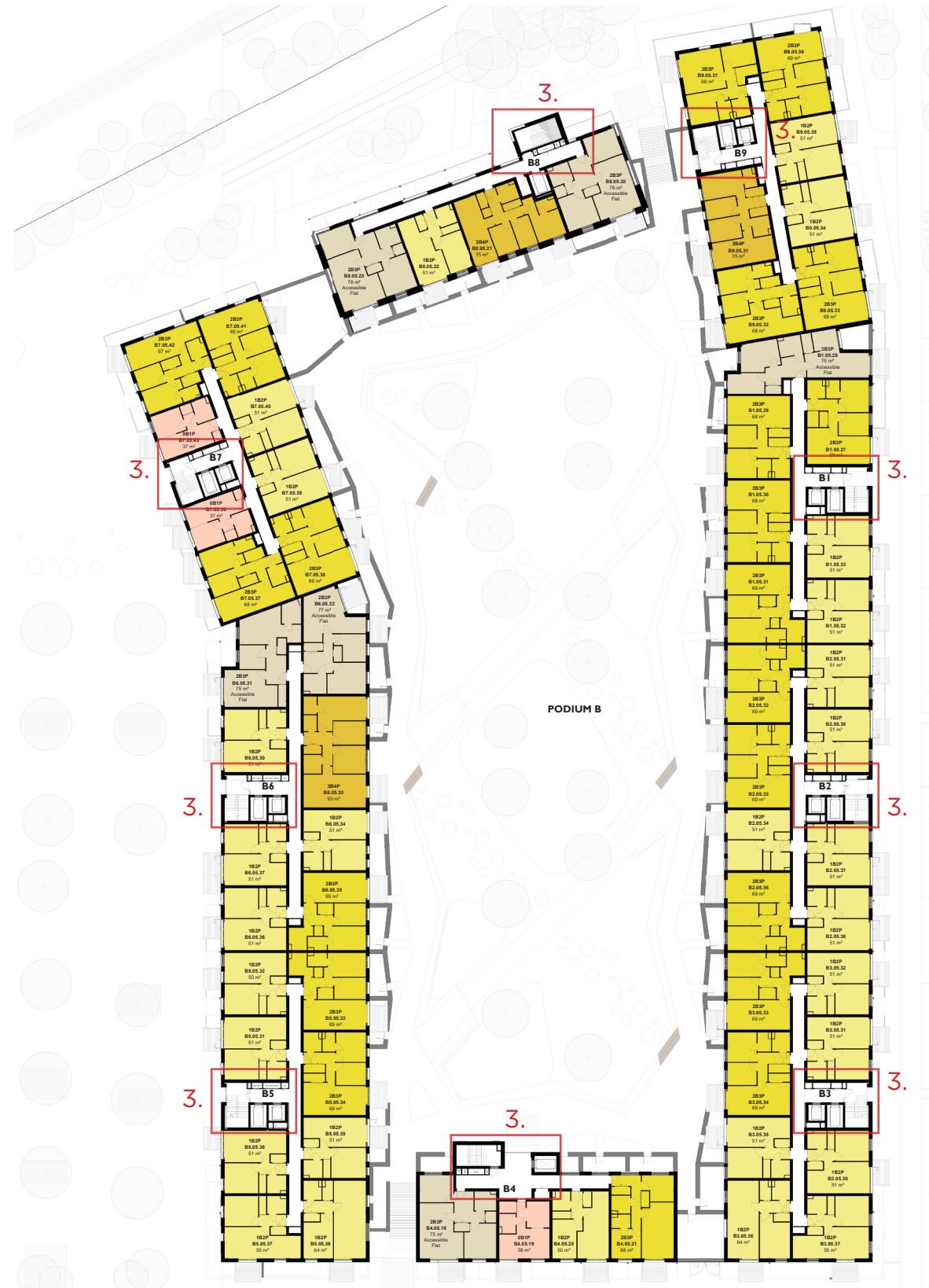
Consented Design - GA Level 05