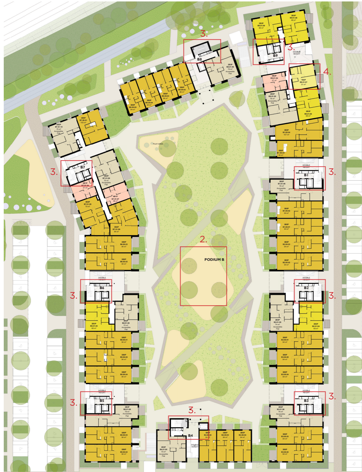
Consented Design - GA Level 01