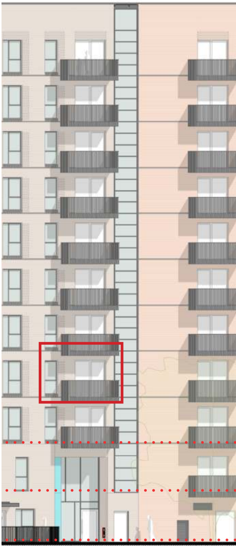
Proposed Design - Elevation A