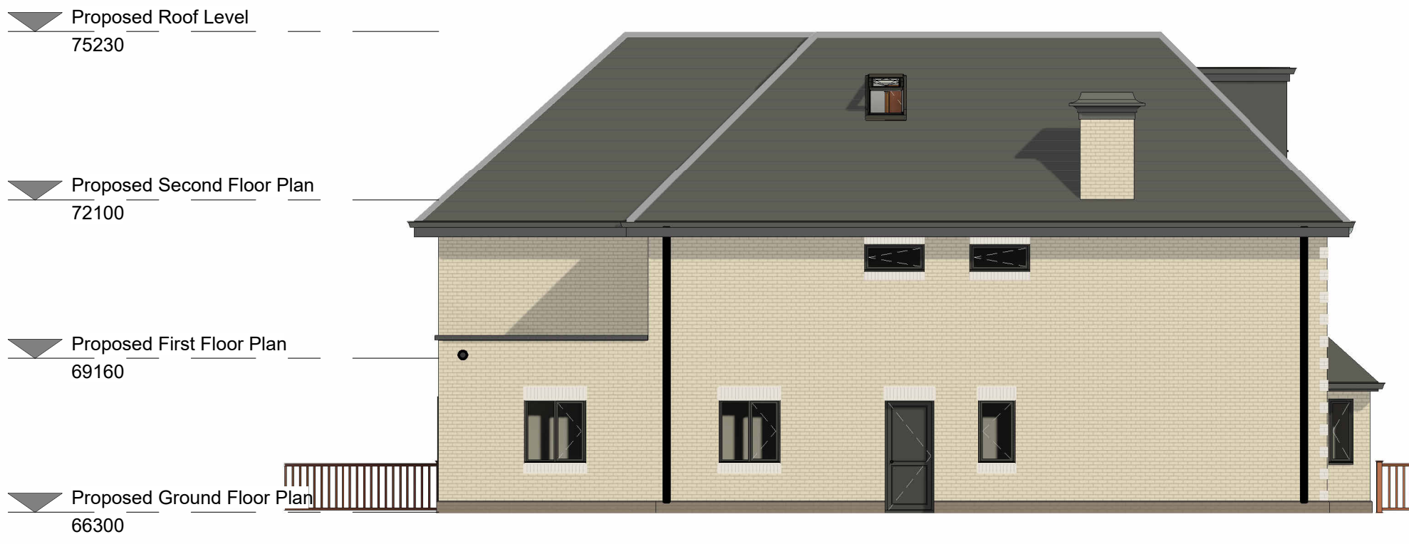
Proposed Side 02 Elevation