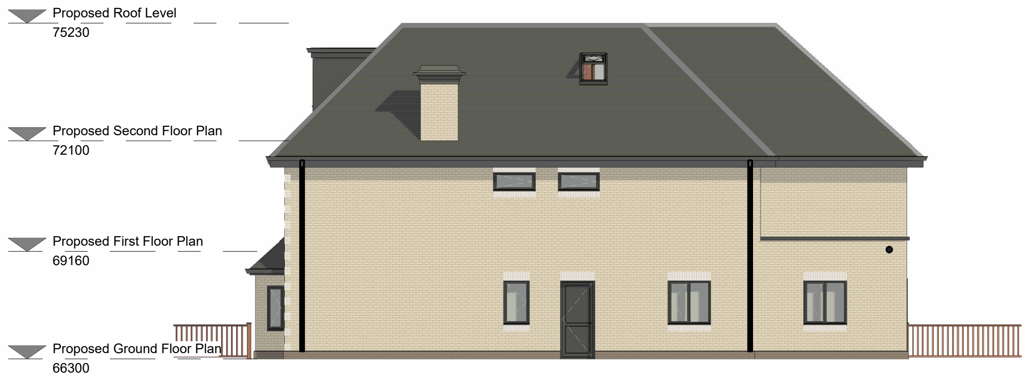
Proposed Side 01 Elevation