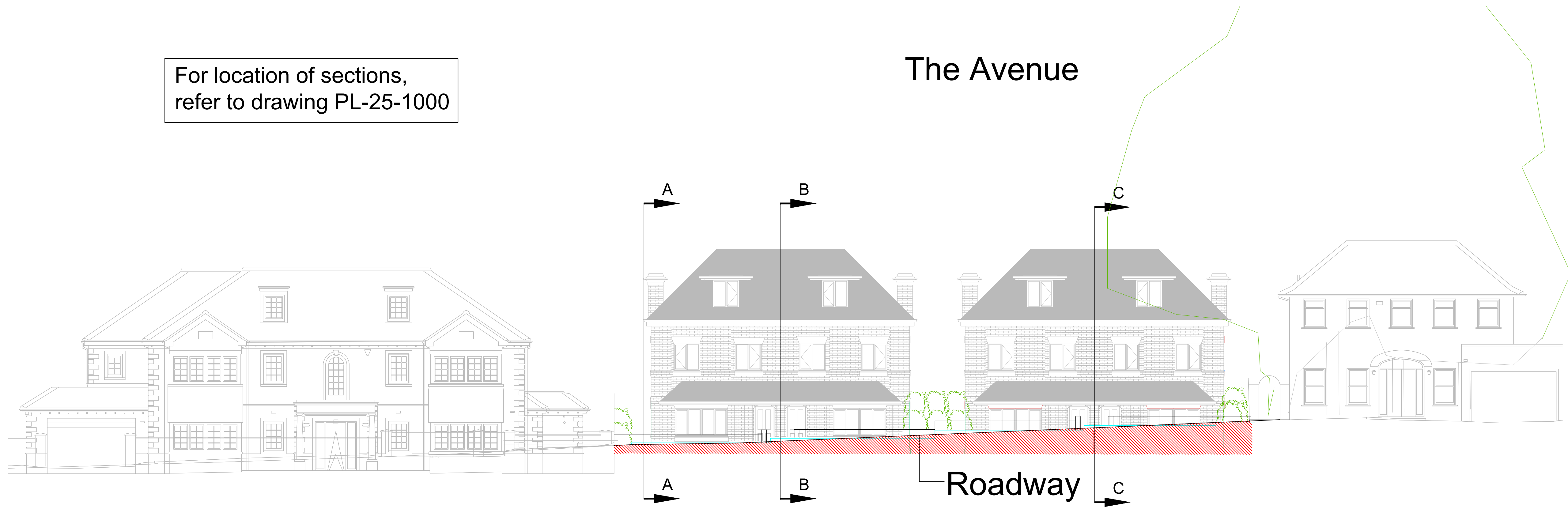
Proposed Street Elevation, showing levels only

For location of sections, refer to drawing PL-25-1000