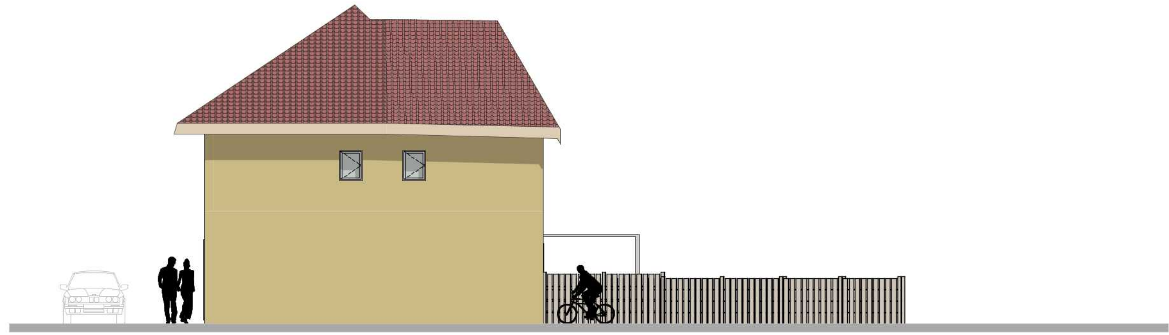
Proposed East Side Elevation