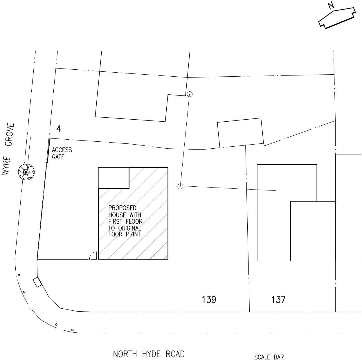
SITE PLAN SCALE:1/250