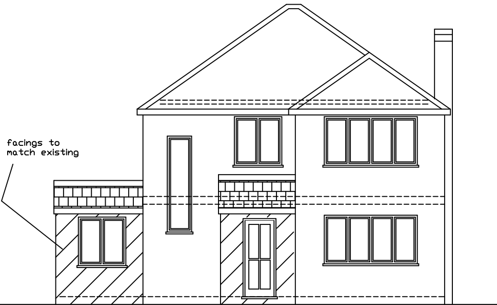
facings to match existing Proposed Front Elevation