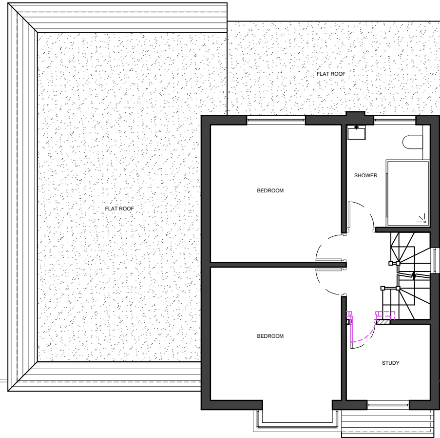
01 - FIRST FLOOR PLAN