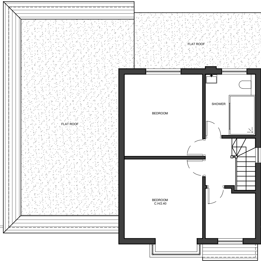
01 - FIRST FLOOR PLAN