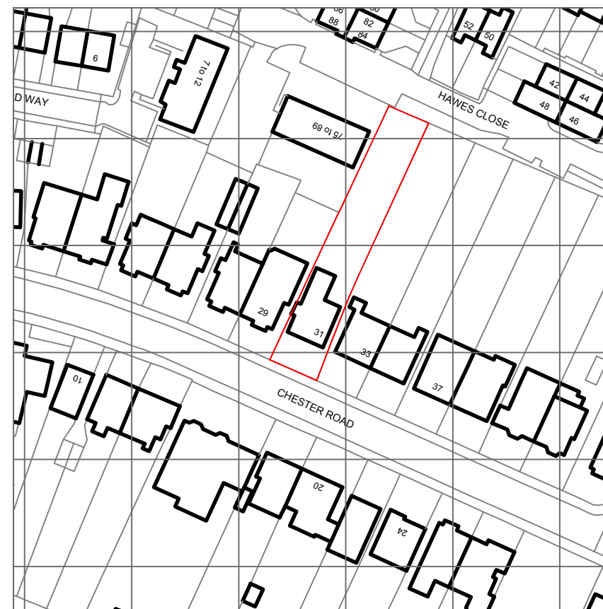
02 Location Plan Scale 1:1250 @ A3