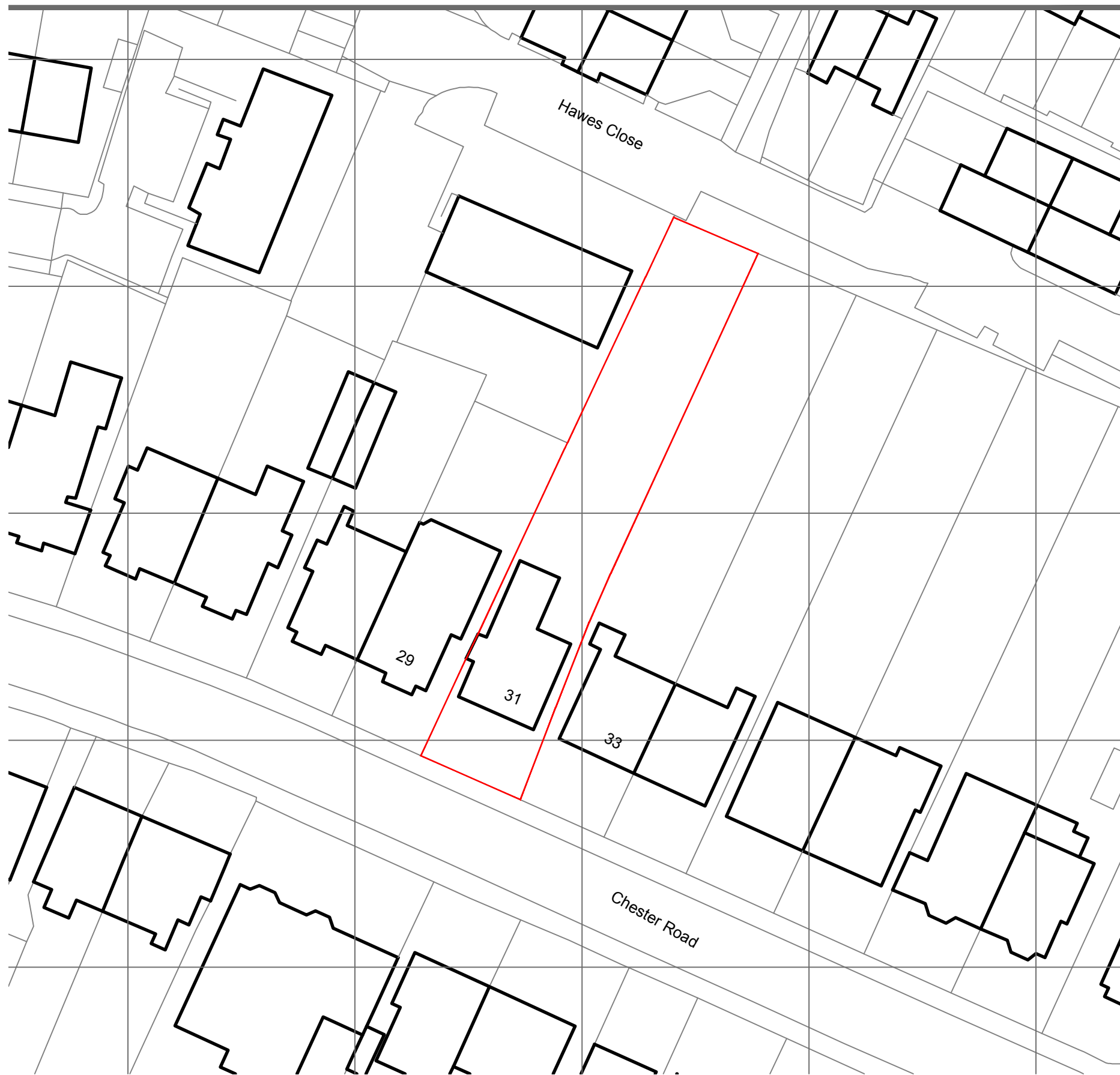
01 Site Plan Scale 1:500 @ A3