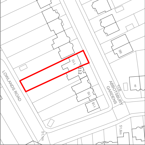
Location Plan Scale 1:1250@A3