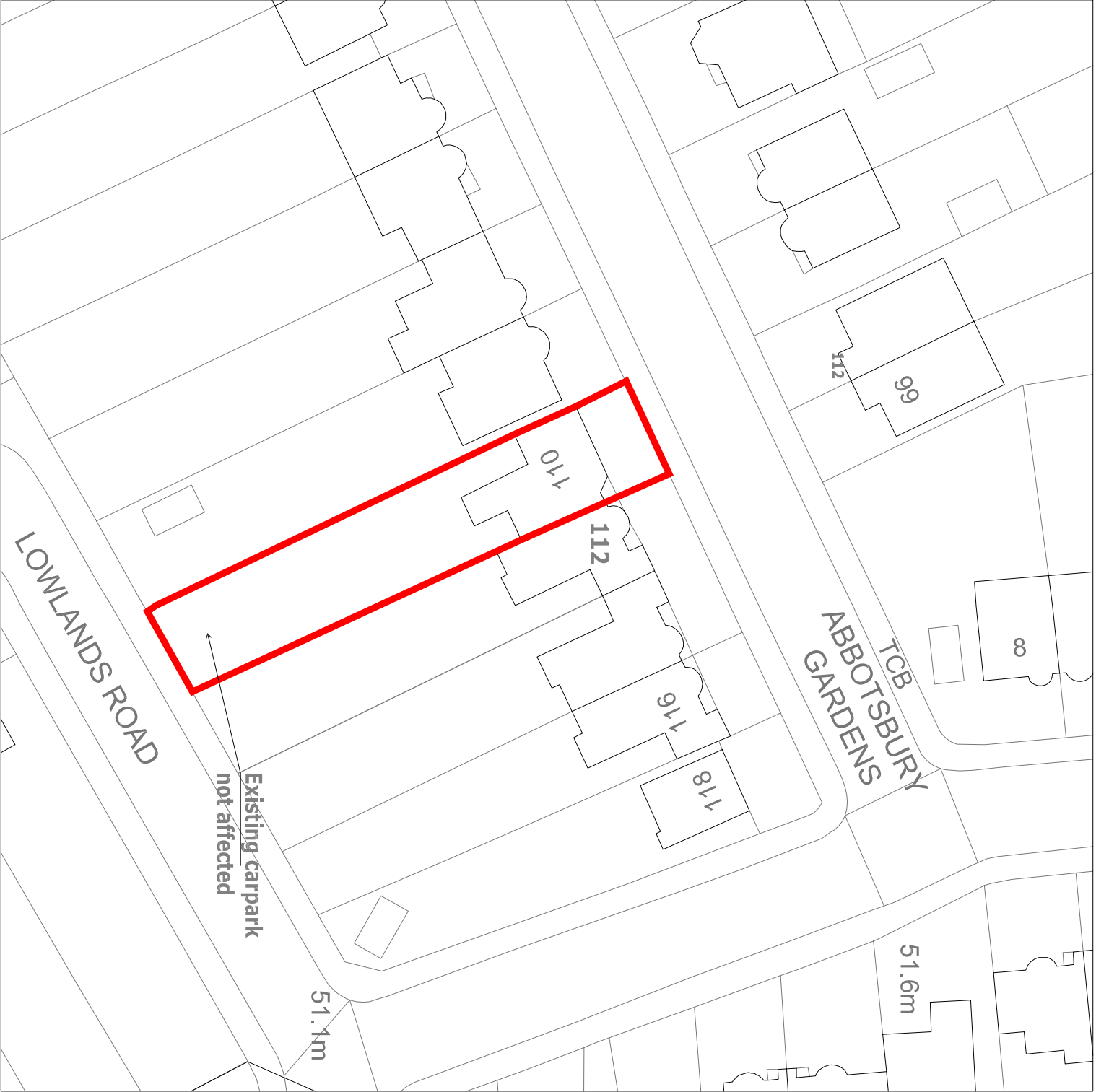
Site Plan Scale 1:500@A3

ALL WORK TO BE CARRIED OUT IN ACCORDANCE WITH THE CURRENT BUILDING REGULATIONS. ALL DIMENSIONS / LEVELS TO BE CHECKED AND VERIFIED ON SITE BEFORE COMMENCEMENT OF WORK. THIS DRAWINGS TO BE RED IN CONJUNCTION WITH PROJECT WORKING DRAWINGS, SPECIFICATIONS, DETAILS AND STRUCTURE DRAWINGS. ALL MATERIAL USED IN THE PROPOSED EXTENSION SHOULD MATCH THE EXISTING BUILDING.