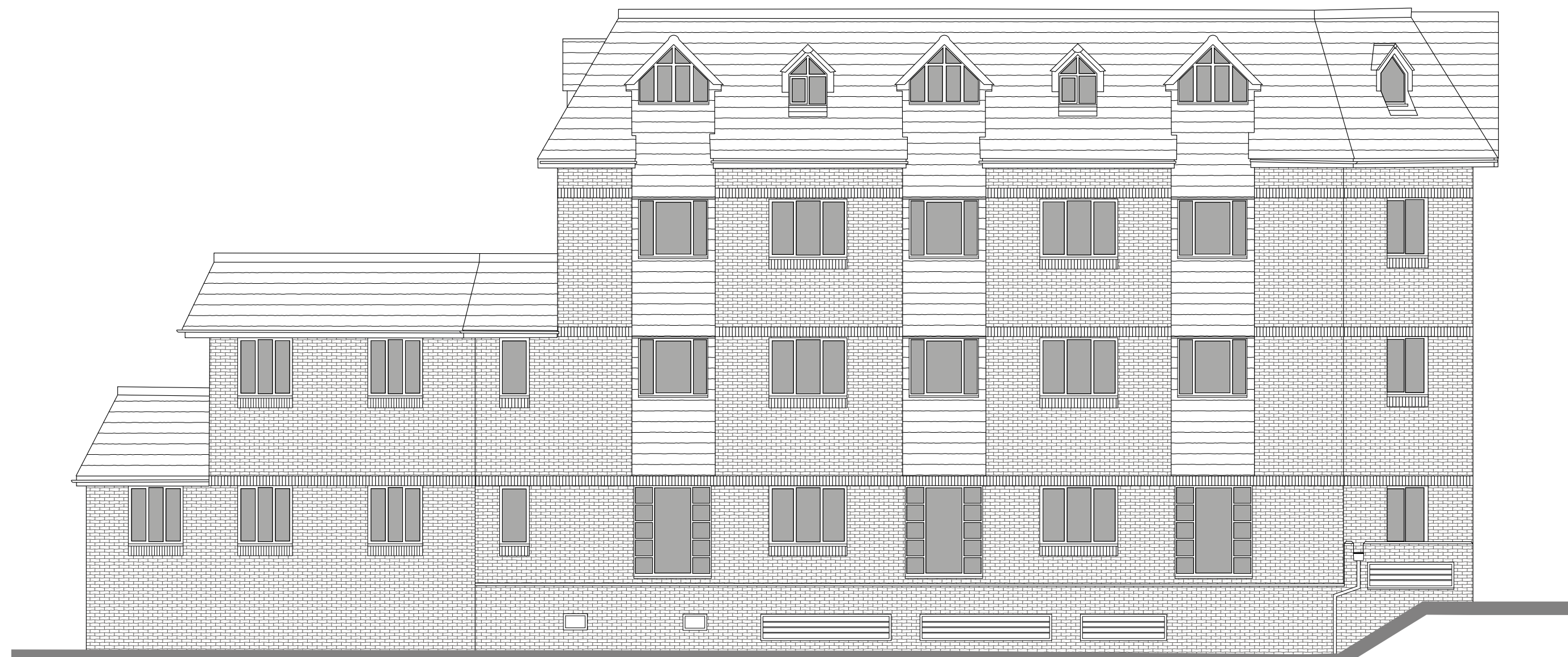
Proposed and Existing Side Elevation