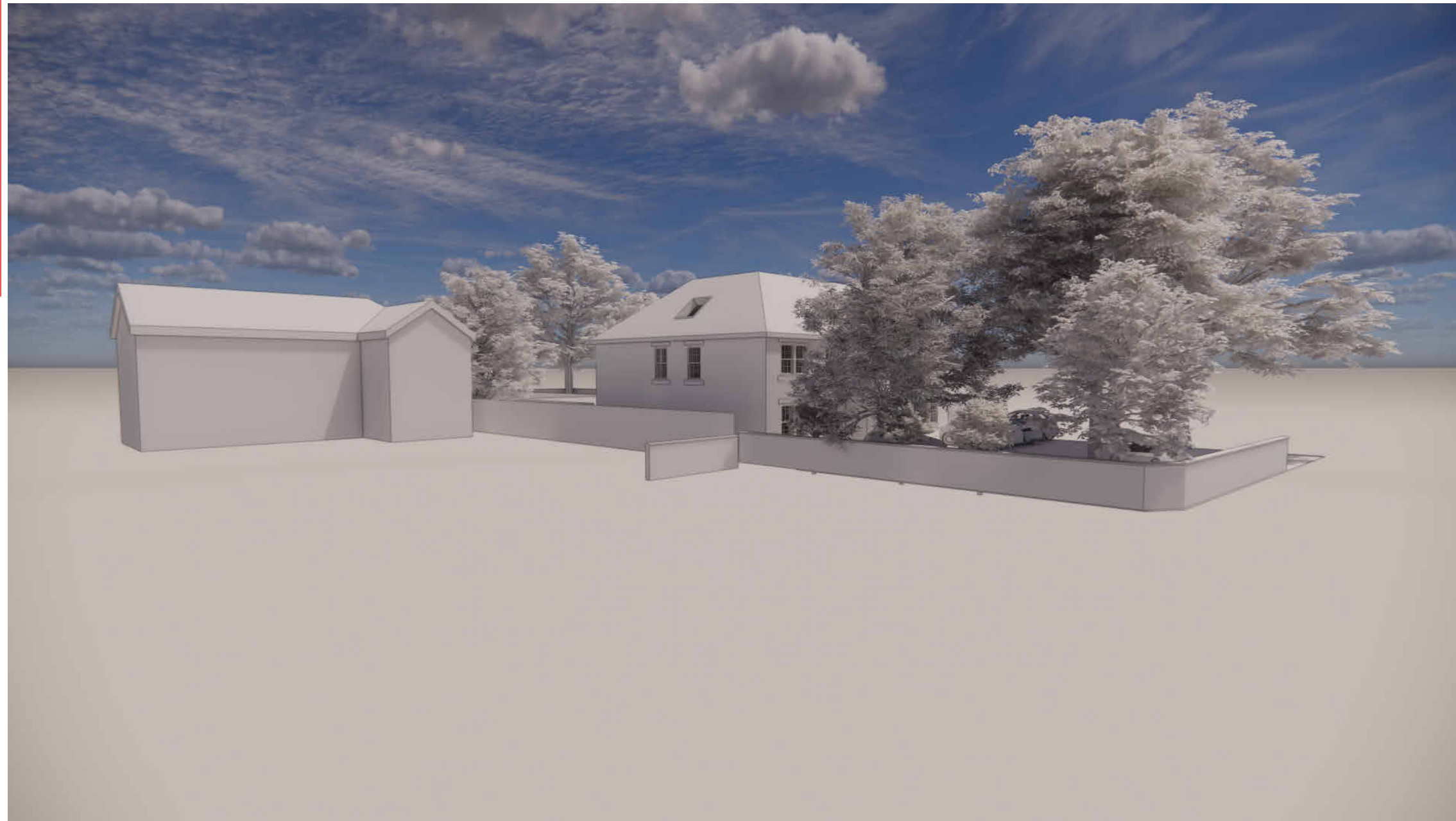
3 Street Perspective 1:1