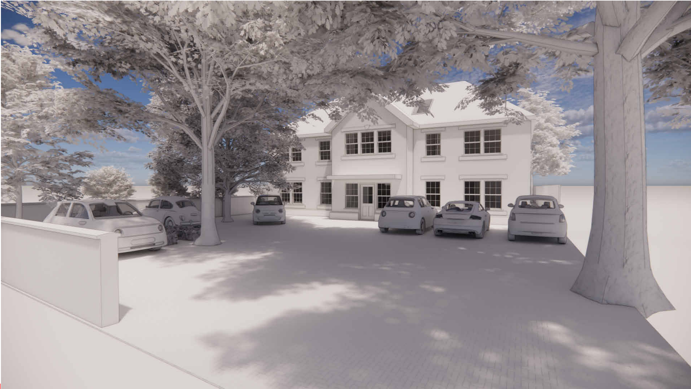
2 Front Perspective 1:1