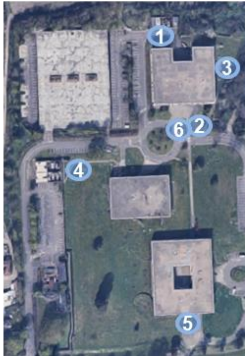
Figure 2: On Site Sound Pressure Level Measurement Positions