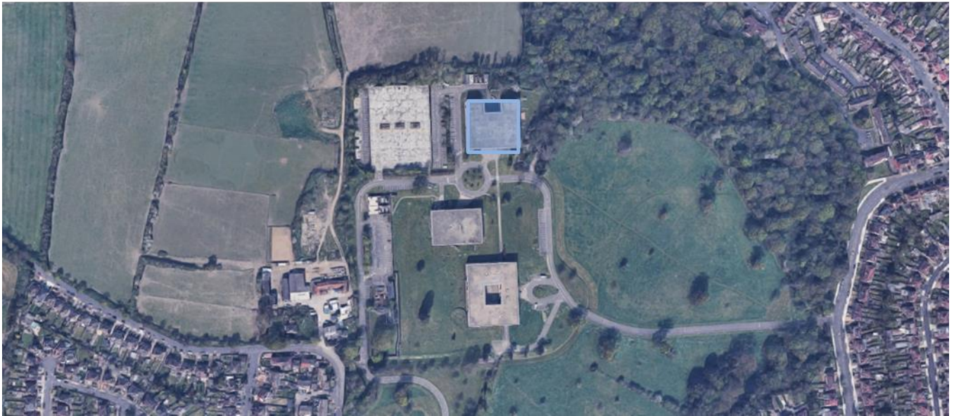
Figure 1: North Building Location Map