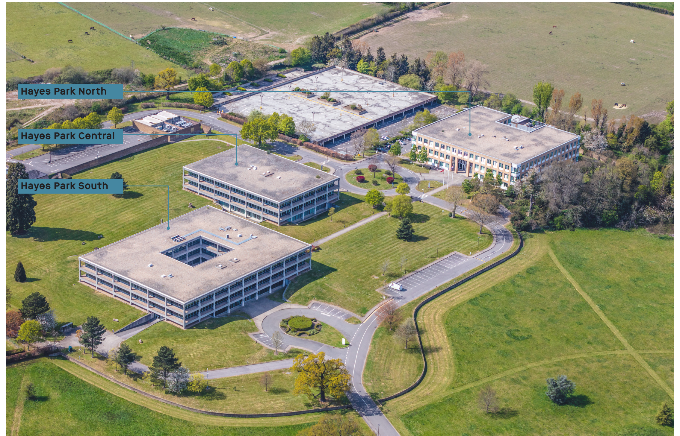
Existing aerial image of Hayes Park

Hayes Park North is typical of office buildings of that period and constitutes of a buff brick facade with a grid of regular openings.