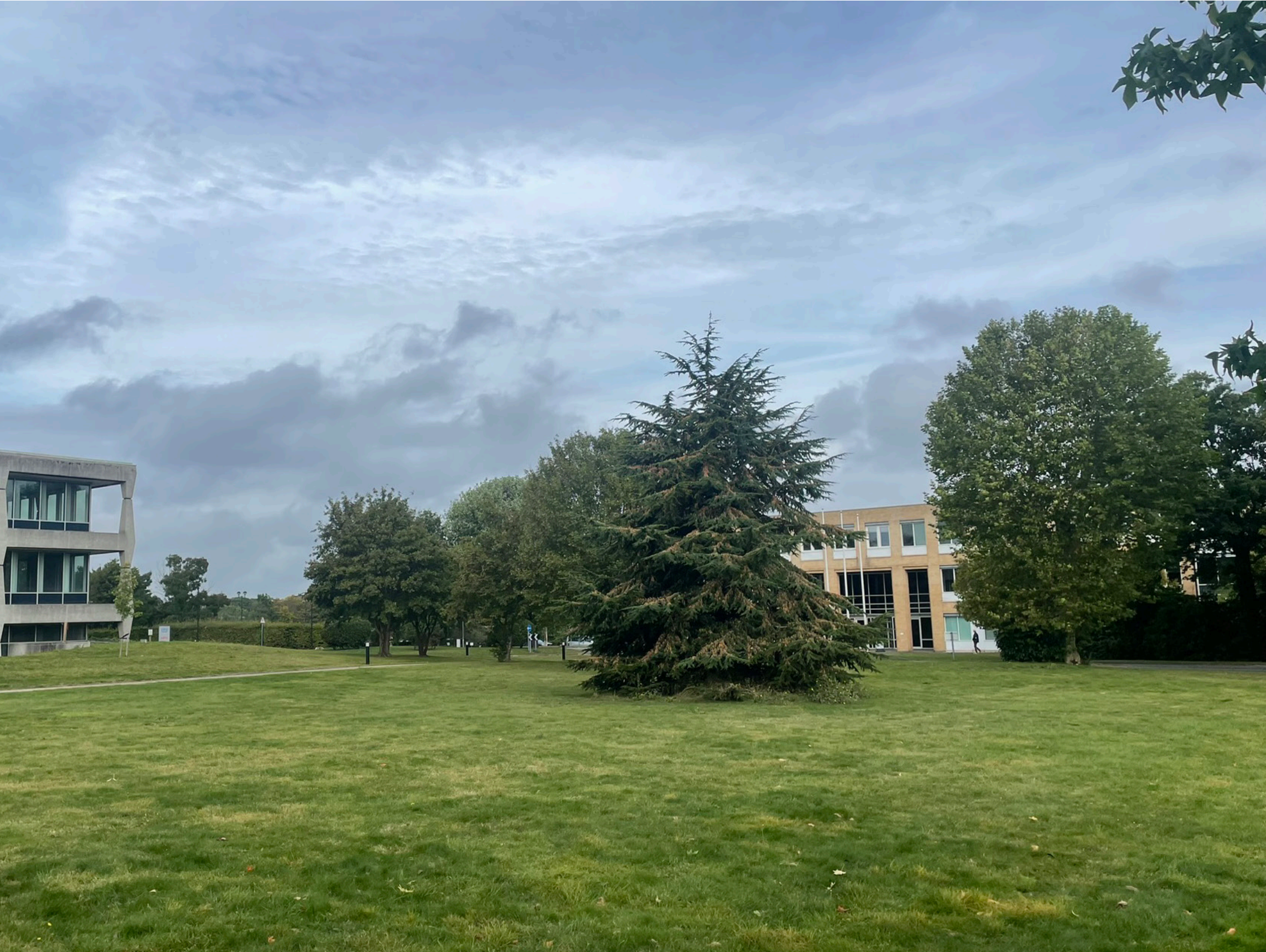
Hayes Park North, current photograph.

Change of use of offices on all three floors into a total of 64 residential units comprising 6 x studios, 33 x one-bedroom, 19 x two-bedroom and 6 x three-bedroom units.