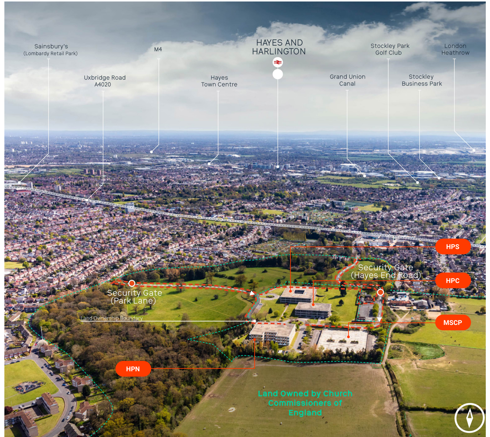
Aerial View with Surrounding Context