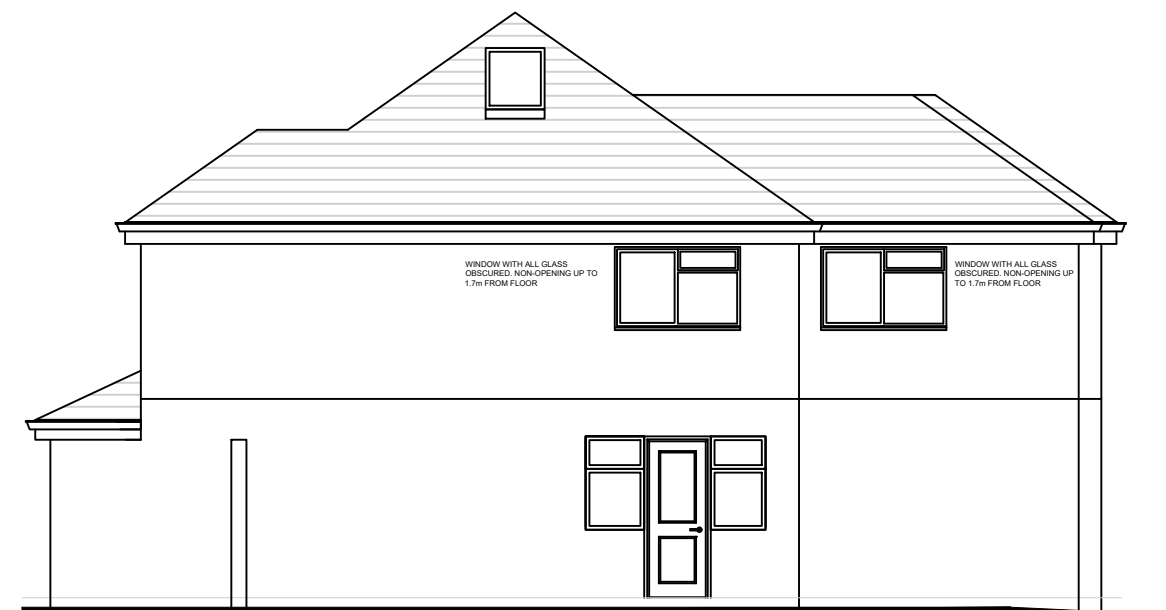
PLA PROPOSED EAST ELEVATION Scale 1:100