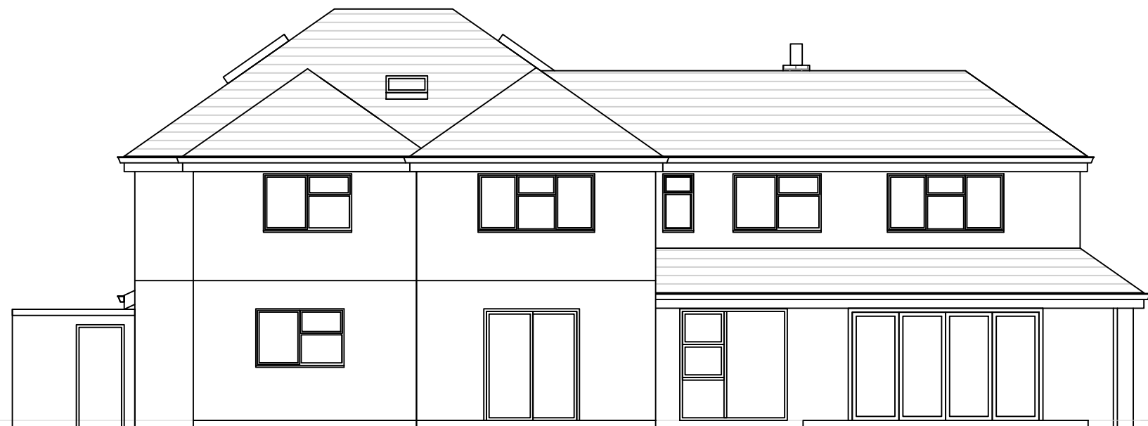
PLA PROPOSED NORTH ELEVATION Scale 1:100