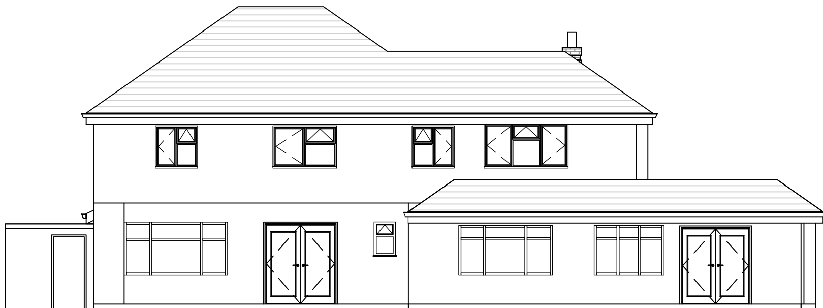
PLA EXISTING NORTH ELEVATION Scale 1:100