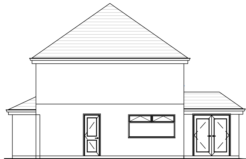
PLA EXISTING EAST ELEVATION Scale 1:100