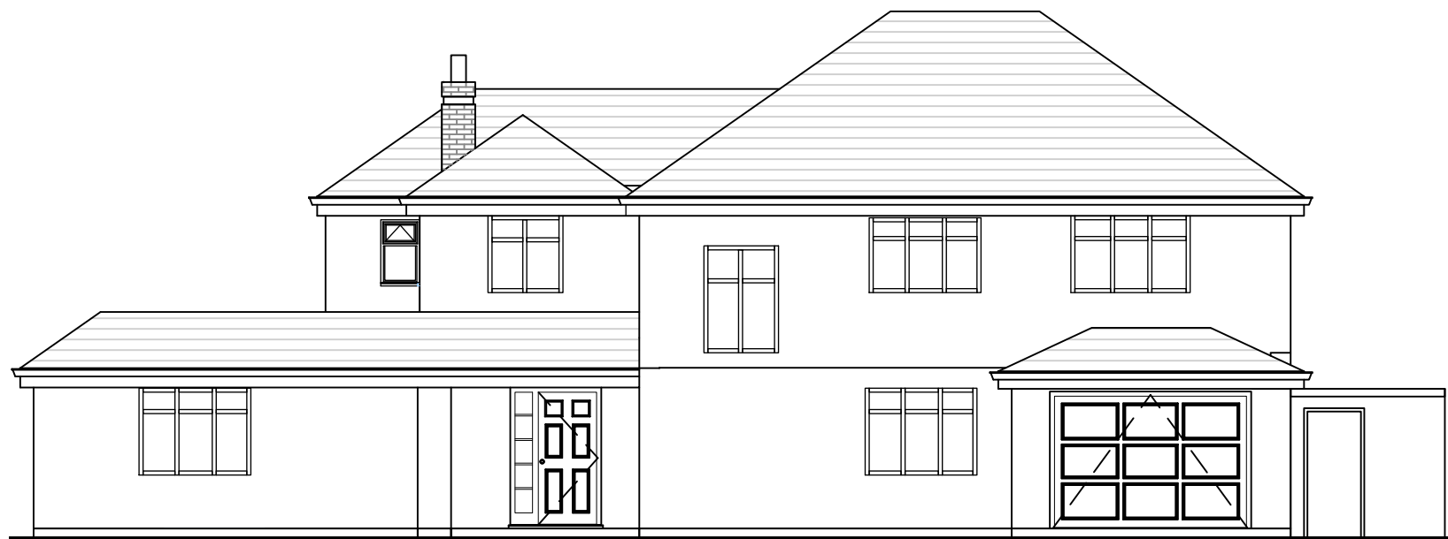
PLA EXISTING SOUTH ELEVATION Scale 1:100