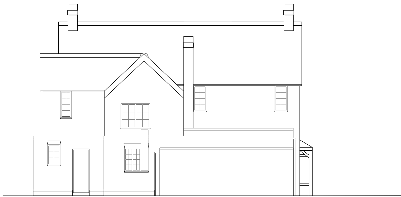
1 EXISTING REAR ELEVATION Scale: 1:100