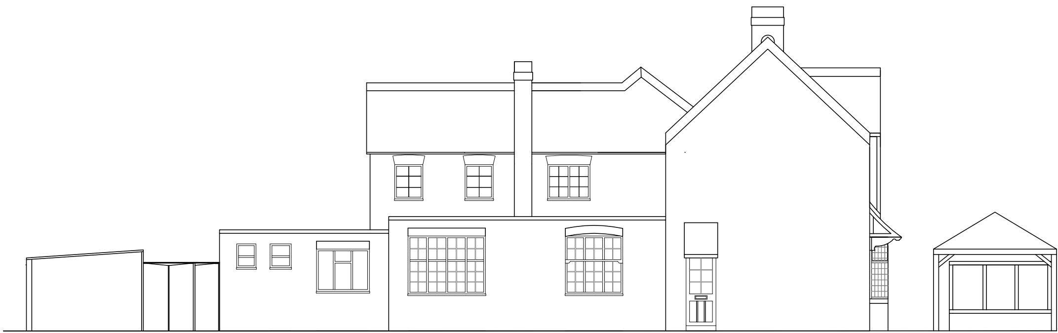
2 EXISTING SIDE ELEVATION Scale: 1:100