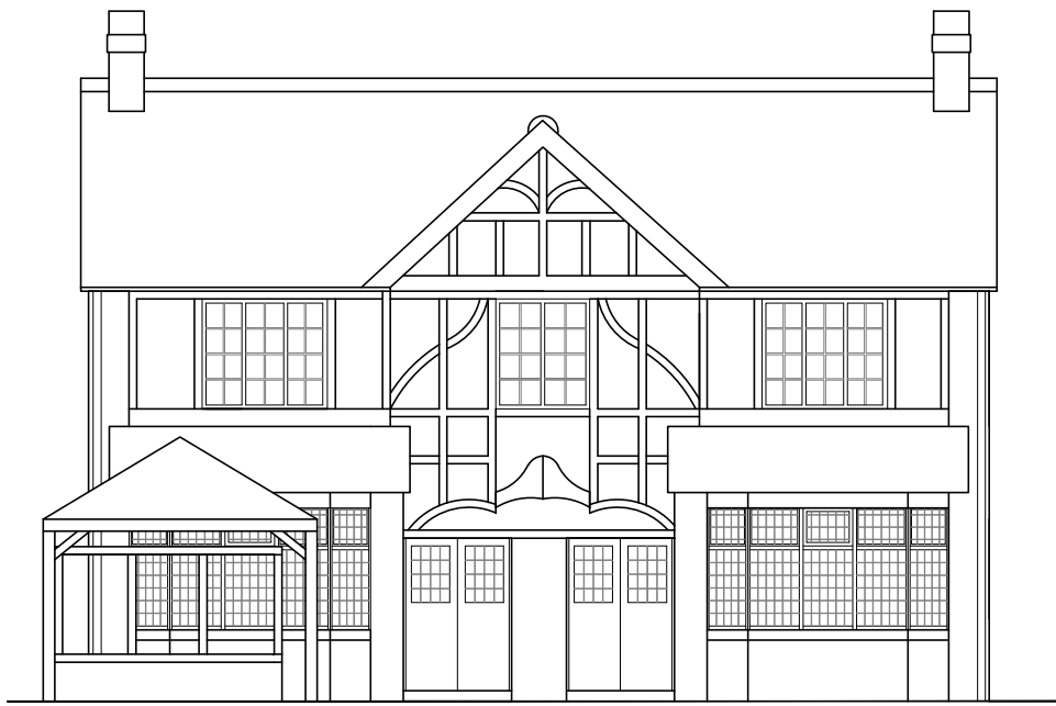
3 EXISTING FRONT ELEVATION Scale: 1:100