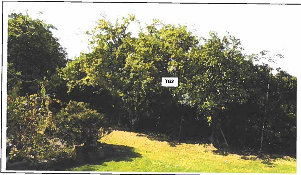
View of TG2 Apple group

Property: 6 Windrush Close Iskenham Uxbridge UB10 8EJ