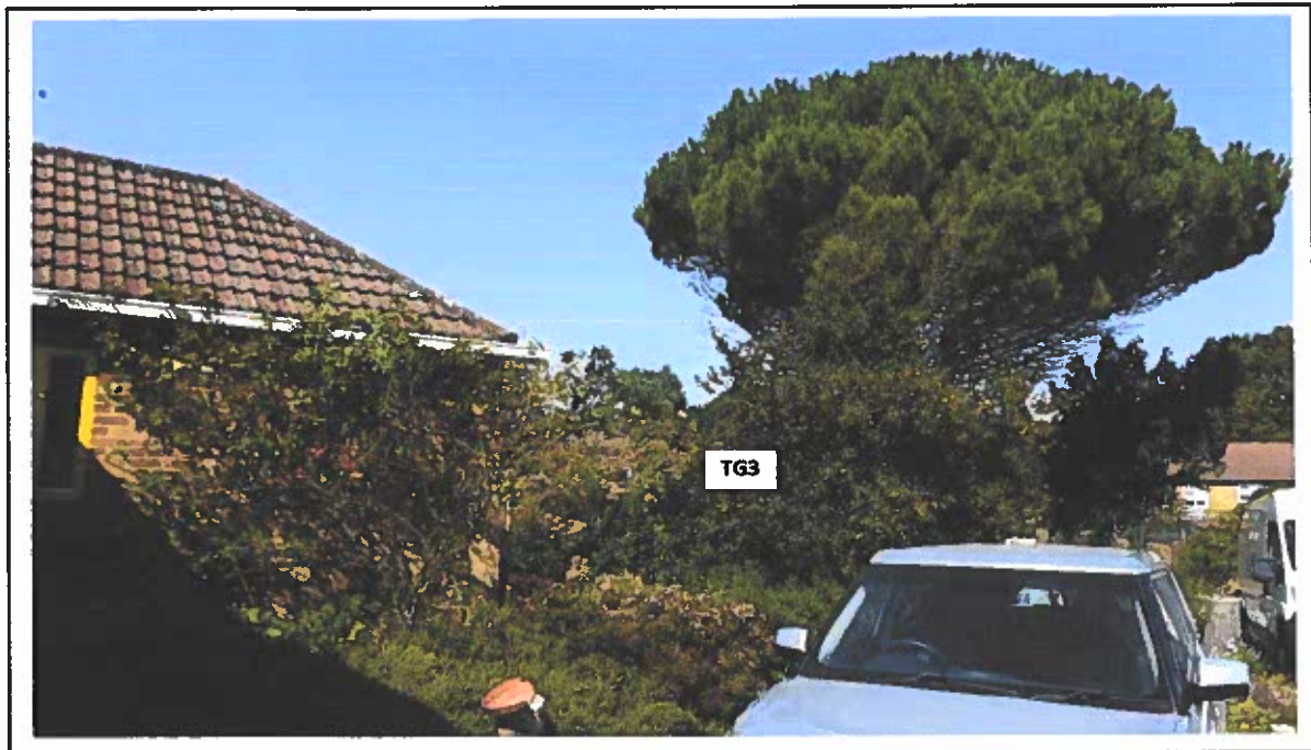
View of TG3 Pine, Holly and shrub group at property frontage