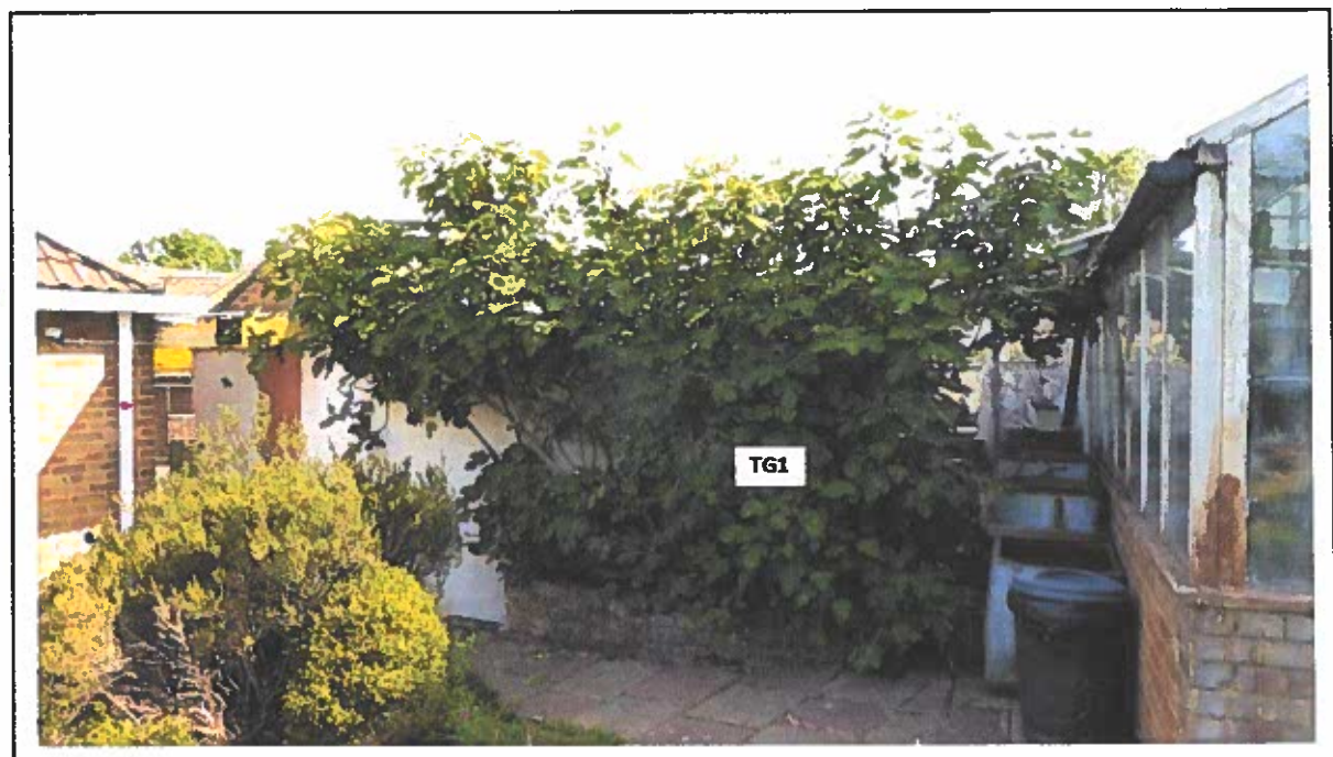
View of TG1 Fig group

Property: 6 Windrush Close Iskenham Uxbridge UB10 8EJ