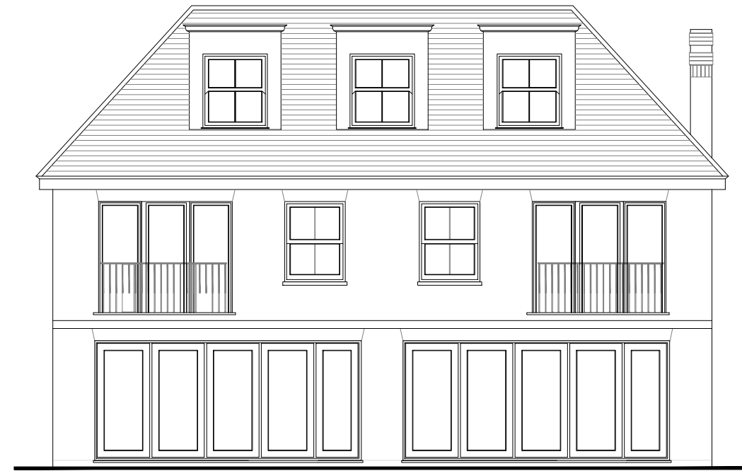
② REAR ELEVATION Scale: 1:100 @ A3