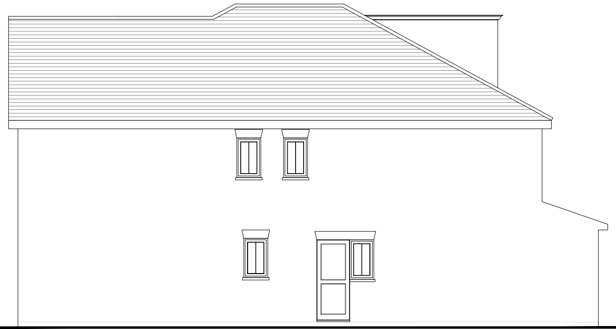
③ SIDE ELEVATION Scale: 1:100 @ A3