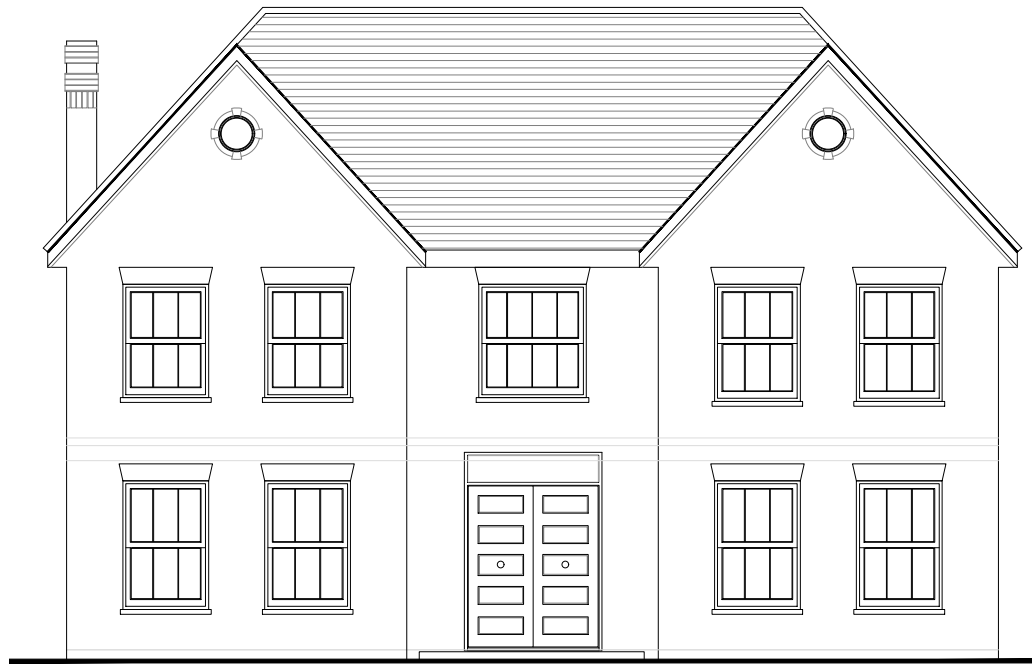
① FRONT ELEVATION Scale: 1:100 @ A3