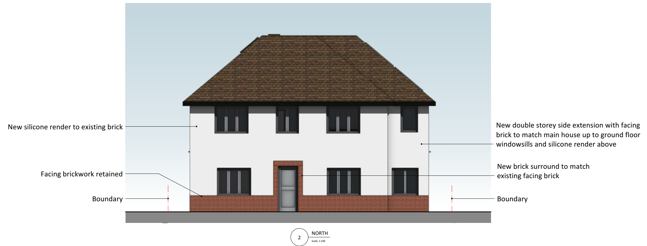
2 NORTH Scale 1:100