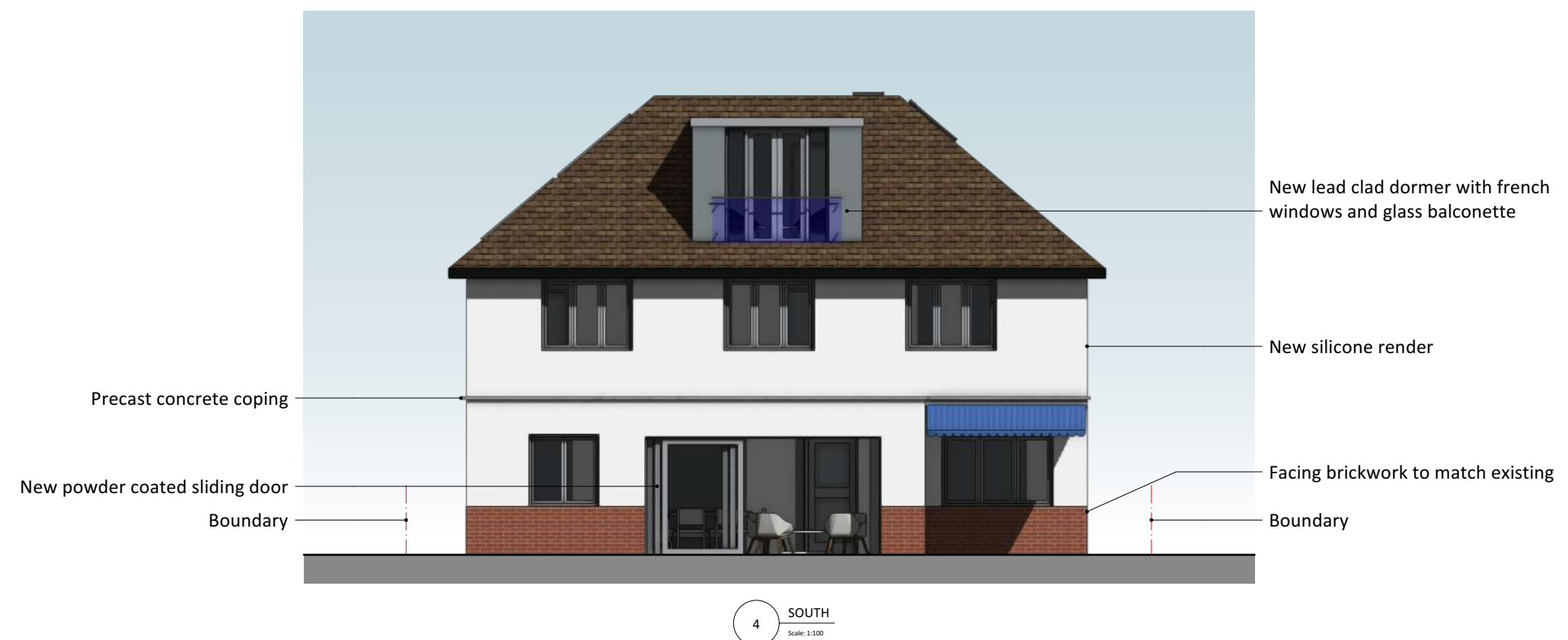
4 SOUTH Scale 1:100