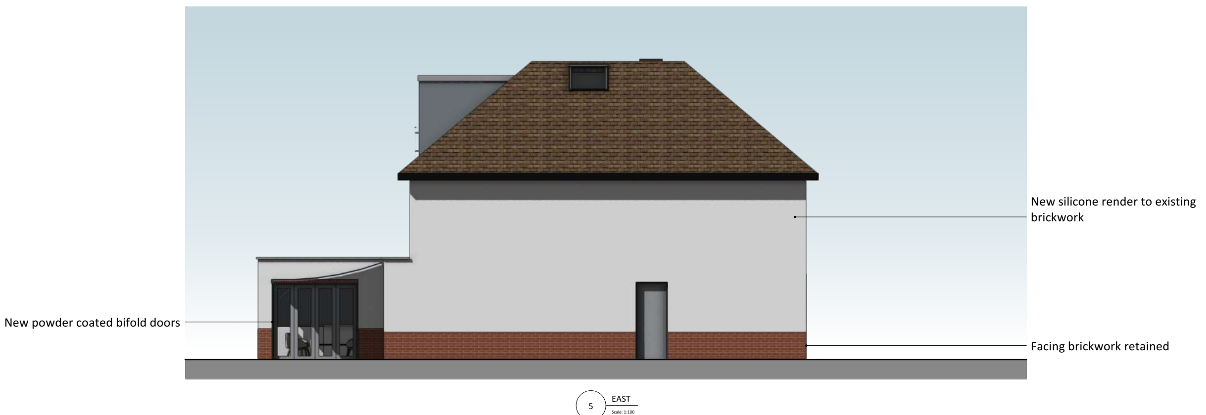
5 EAST Scale 1:100