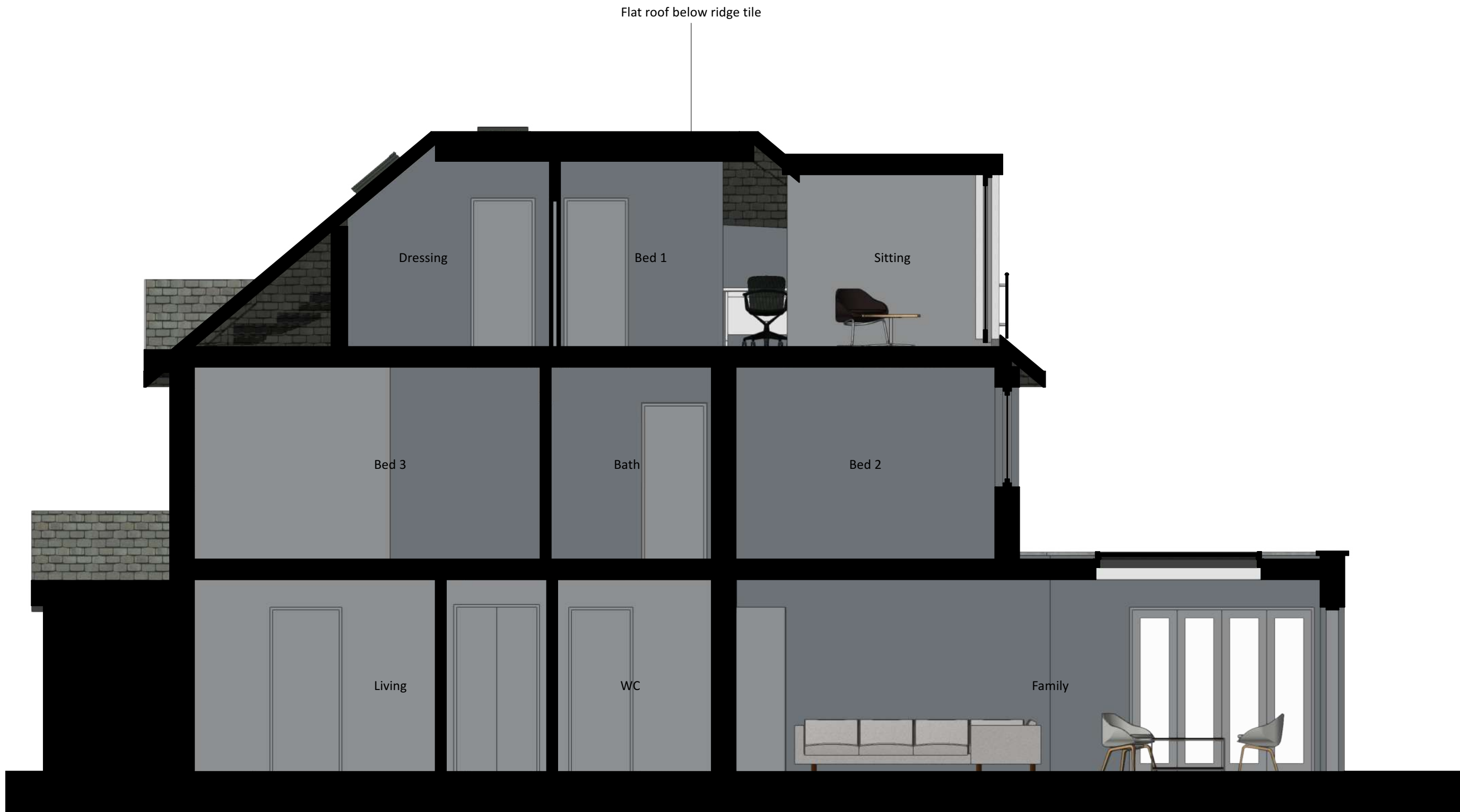
4 Section Scale: 1:50