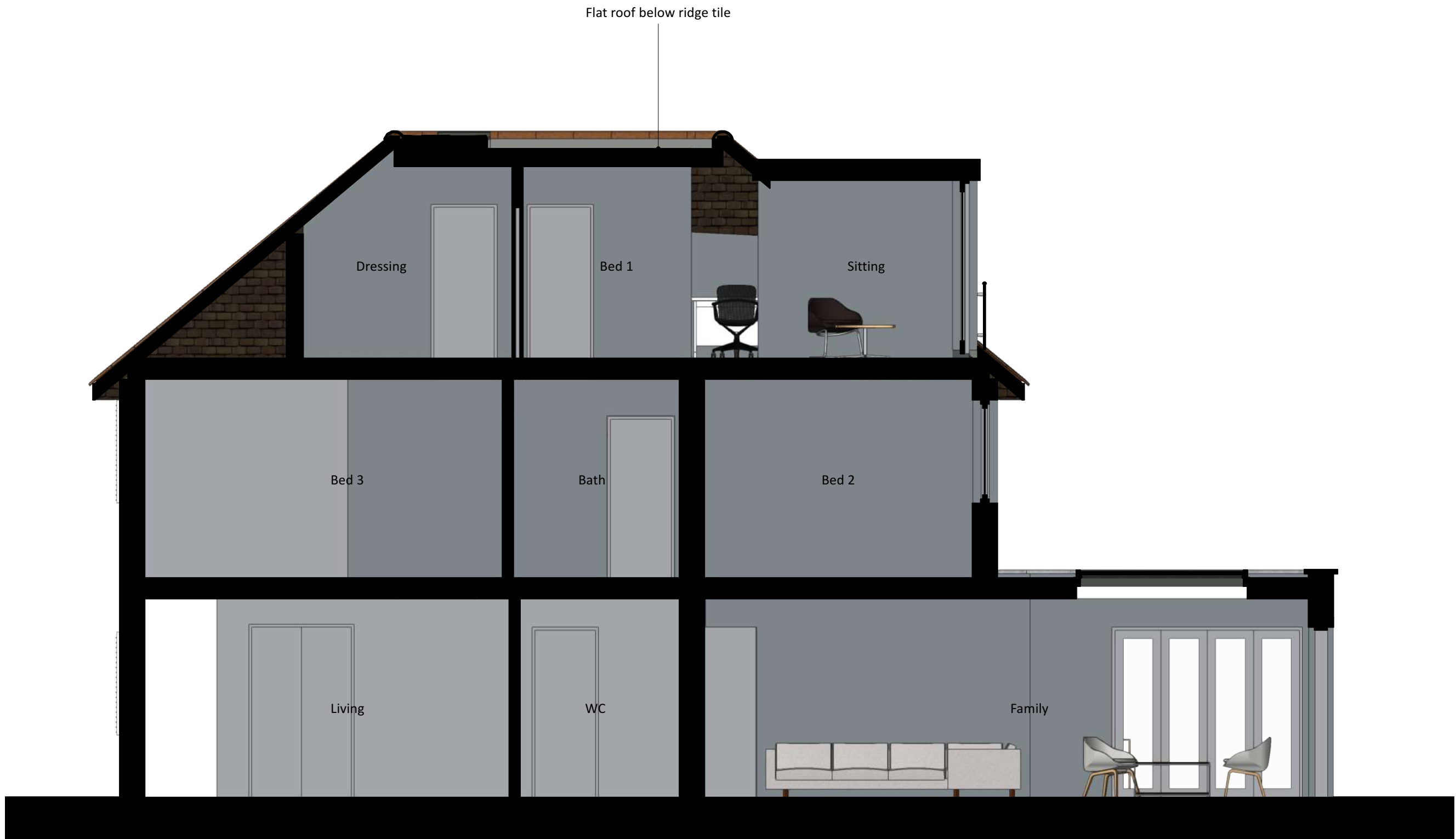
2 Section Scale: 1:50