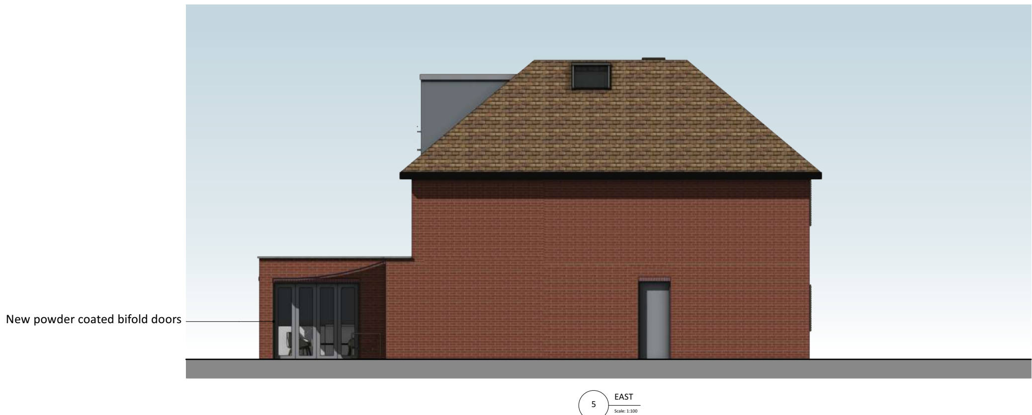
5 EAST Scale 1:100