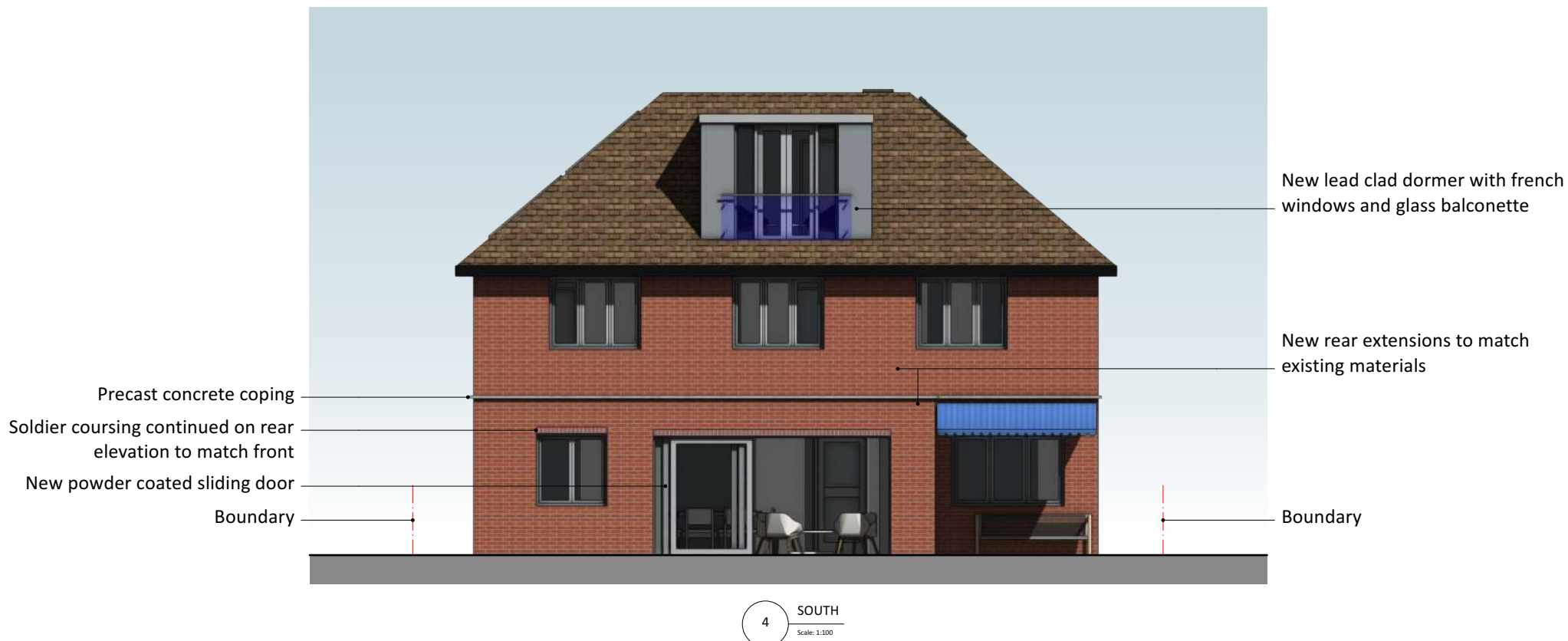
4 SOUTH Scale 1:100