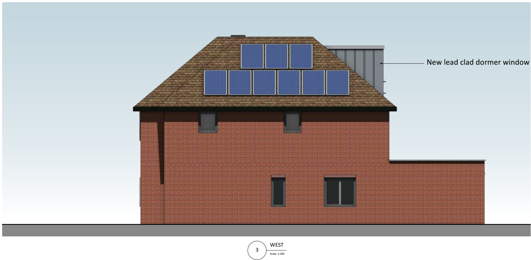
3 WEST Scale 1:100