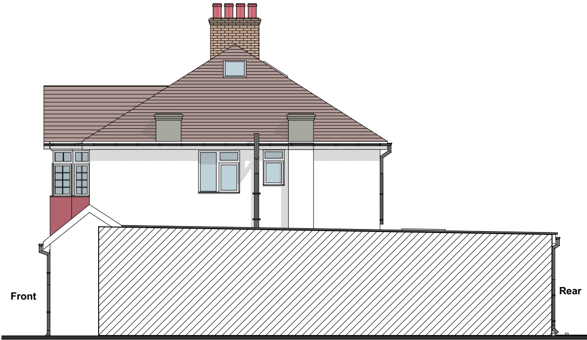
Proposed Flank Elevation 1:100

COPYRIGHT: The contents of this drawing may not be reproduced in whole or in part without express written consent of ARKSS Design Studio Limited.