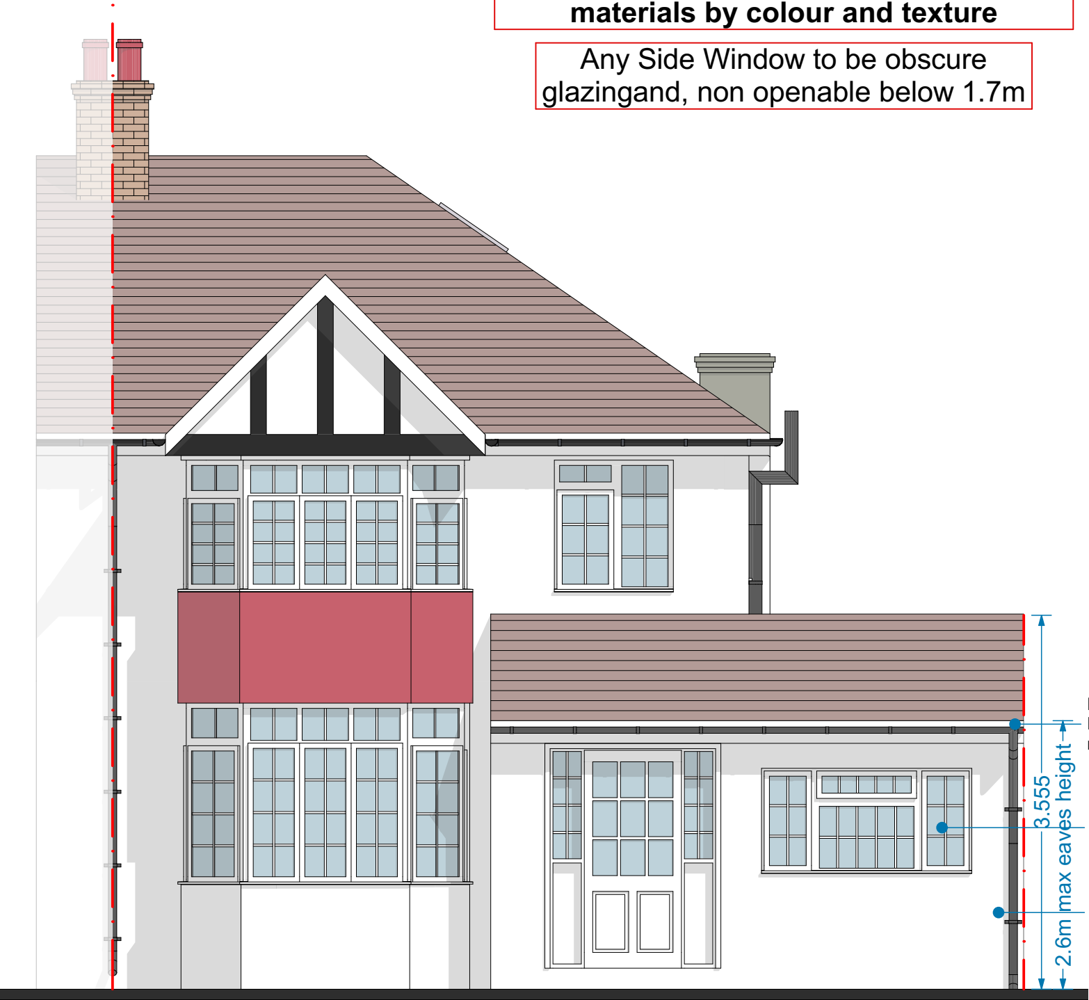
Proposed Front Elevation 1:50

Any Side Window to be obscure glazing and, non openable below 1.7m