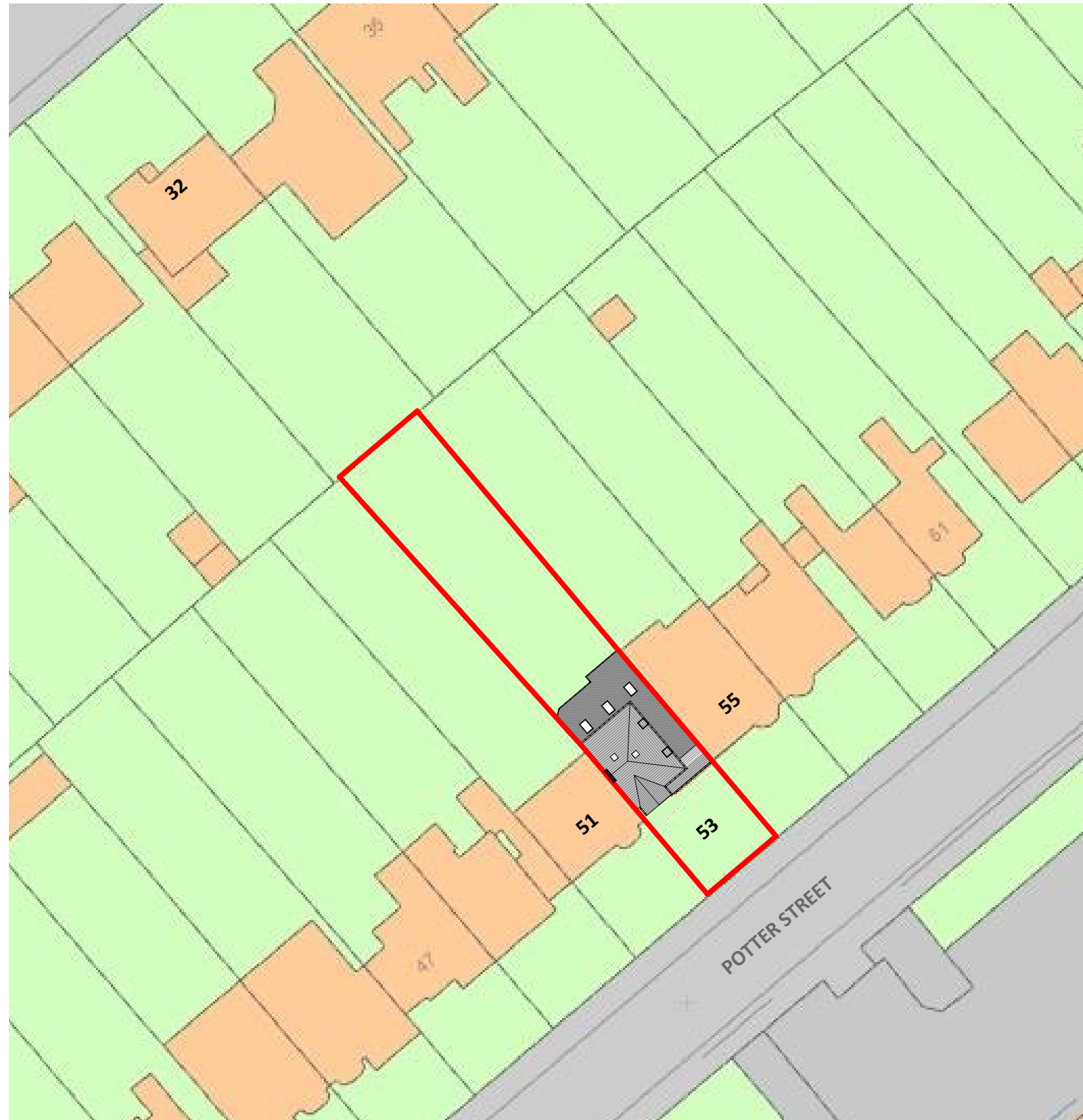
BLOCK PLAN scale 1:500

COPYRIGHT: The contents of this drawing may not be reproduced in whole or in part without express written consent of ARKSS Design Limited.