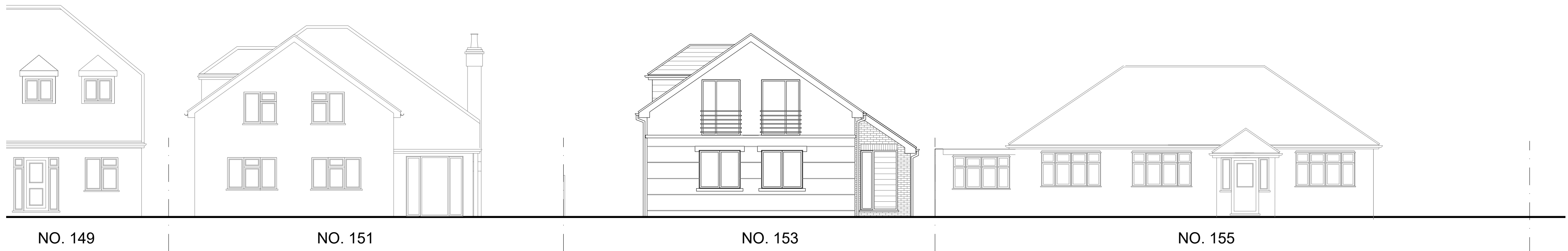
PROPOSED STREET ELEVATION