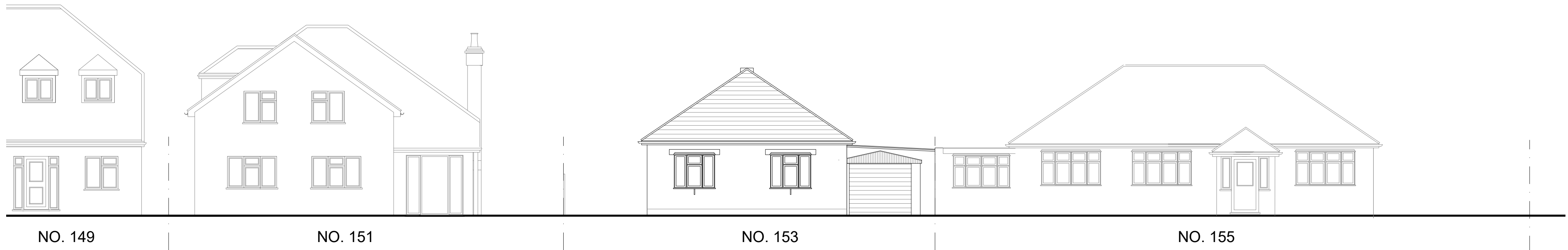
EXISTING STREET ELEVATION