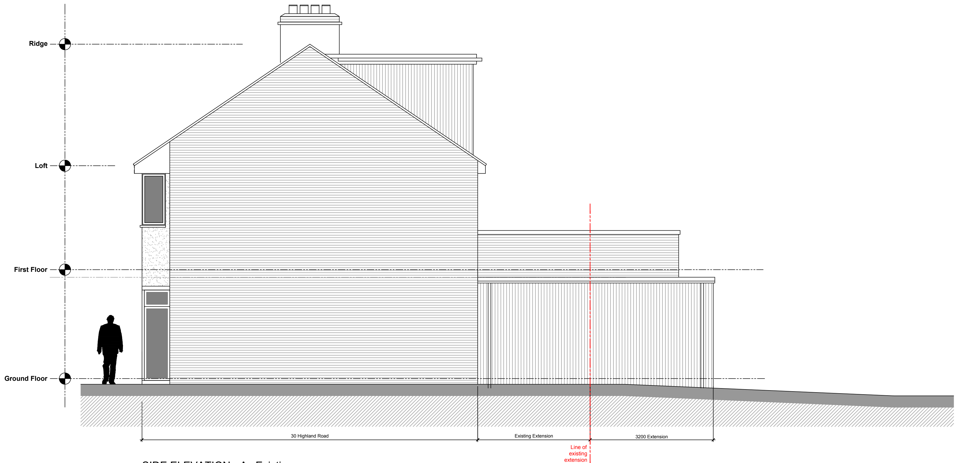
SIDE ELEVATION - As Existing Scale 1:50