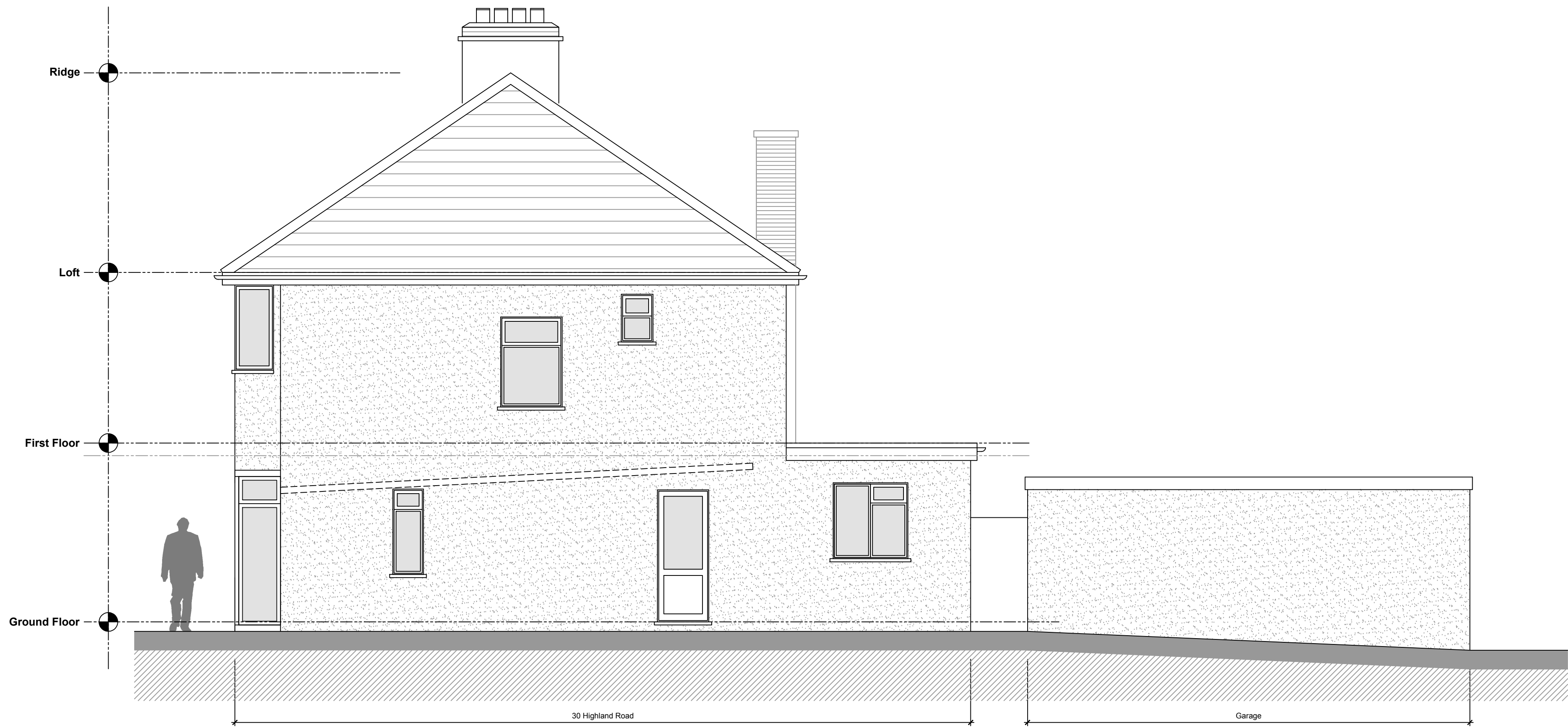
SIDE ELEVATION - As Existing Scale 1:50