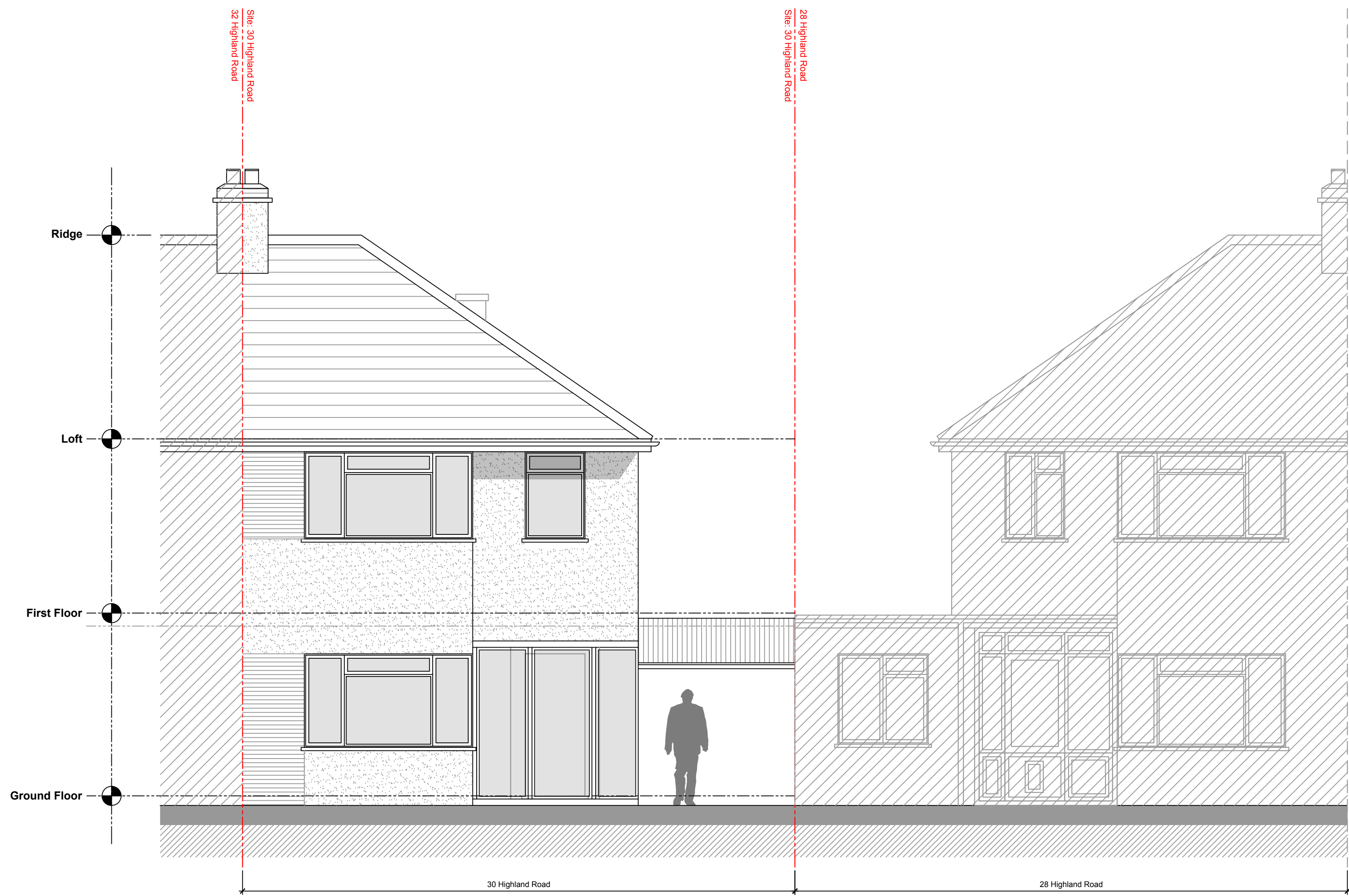
FRONT ELEVATION - As Existing Scale 1:50