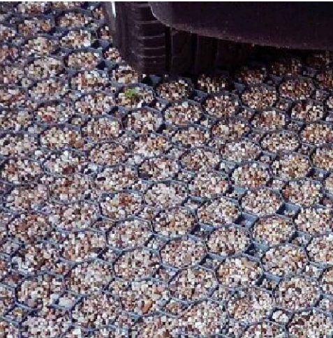
2 PHOTOS - PROPOSED Scale: NTS