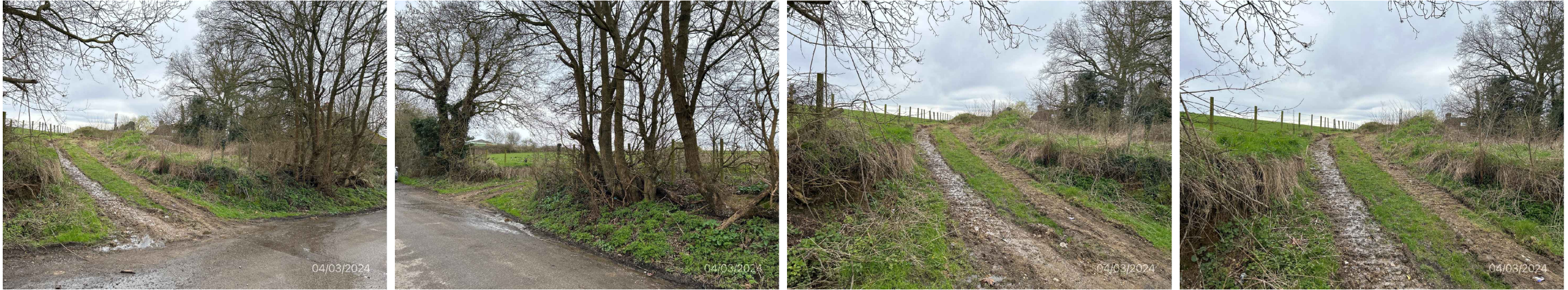
2 PHOTOS - EXISTING Scale: NTS