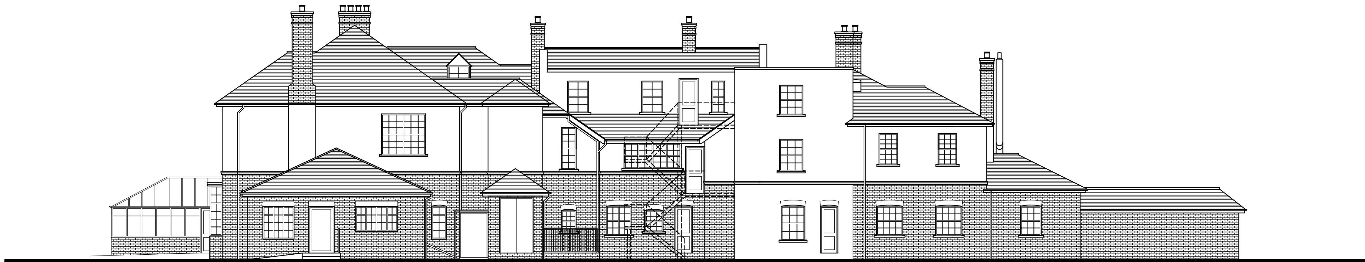
EXISTING NORTH EAST ELEVATION