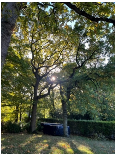
Photo: T8 and T9 – note T8 (right hand tree) being suppressed by T9