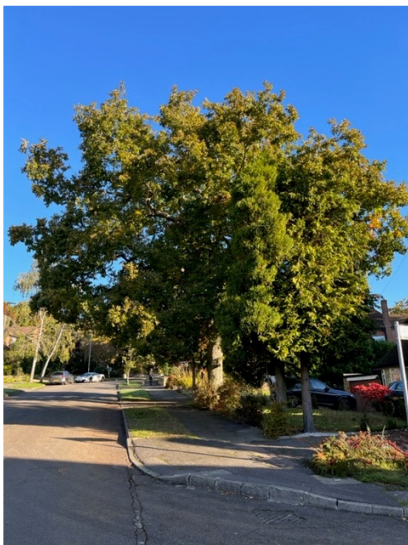
Photo: T1 overhangs Copse Wood Way