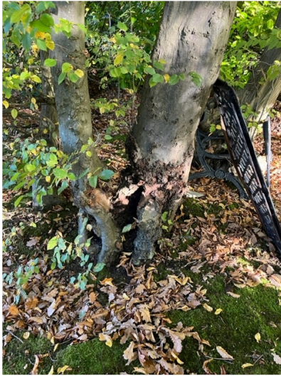
Photo: decay at base of G10

I hope this is of assistance to you, however should you have any queries please do not hesitate to contact me.