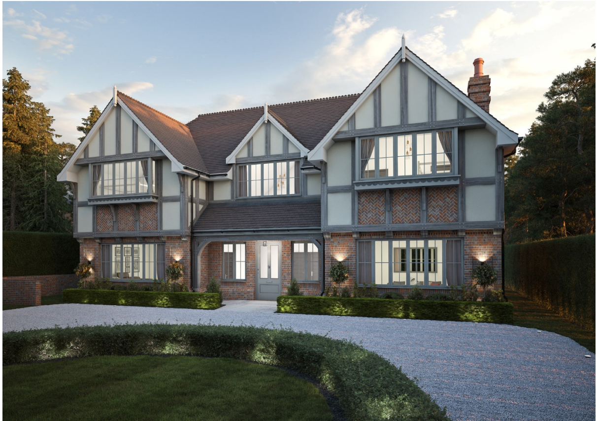
Fig 1 – Illustrative front CGI for 69 Copse Wood Way, Northwood