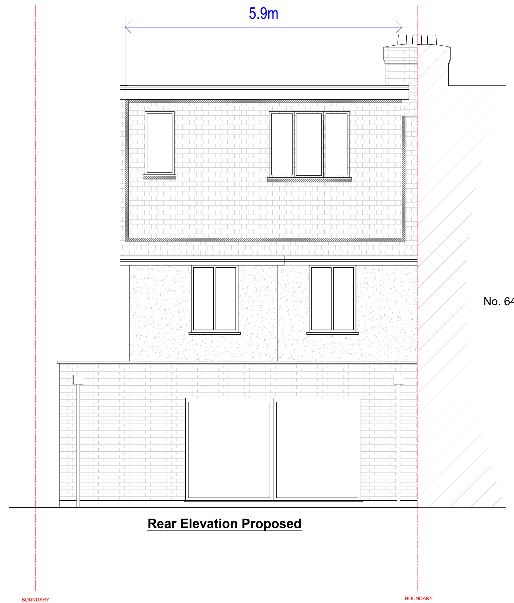
Rear Elevation Proposed