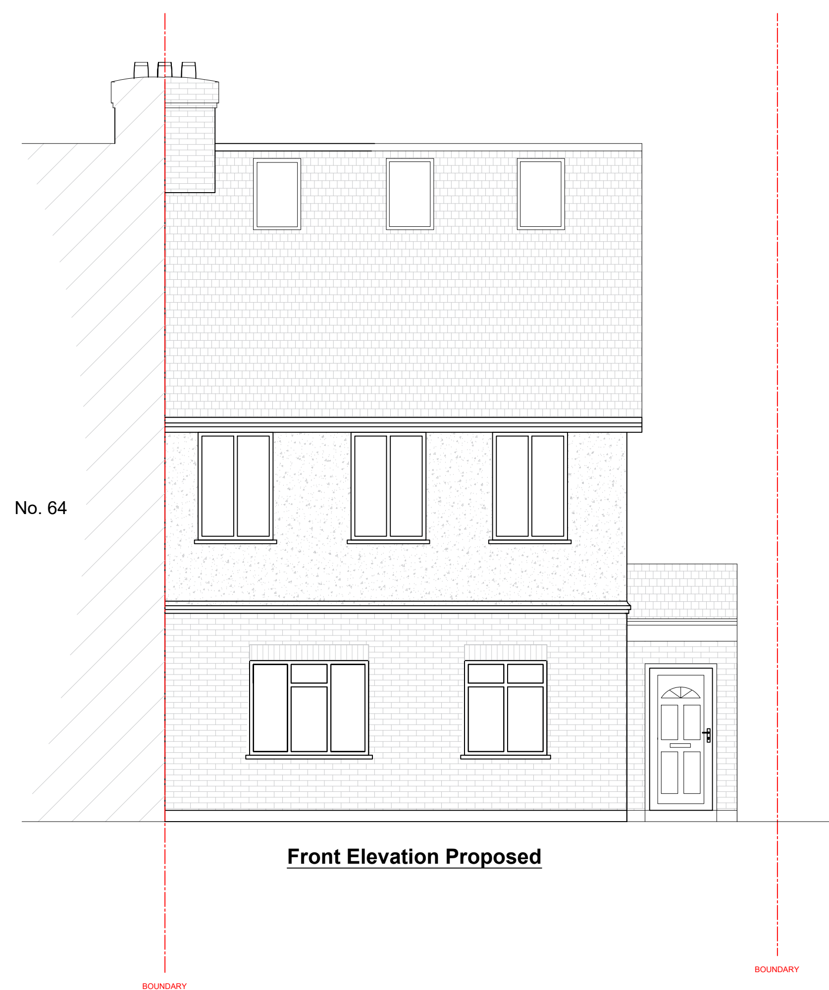
Front Elevation Proposed