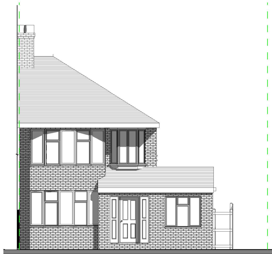
Proposed Front Elevation 1 : 100