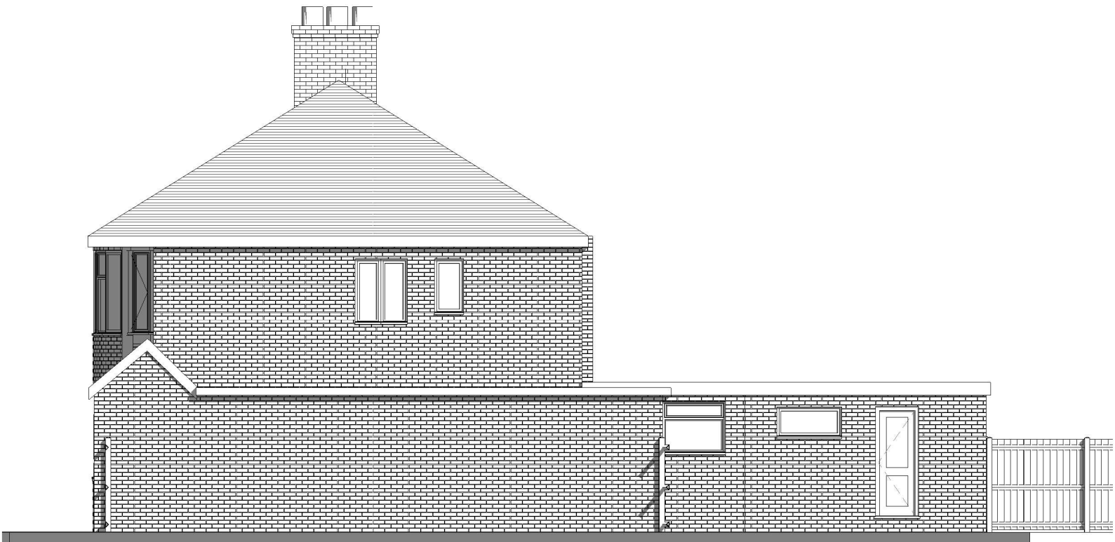
Proposed Side 2 Elevation 1 : 100