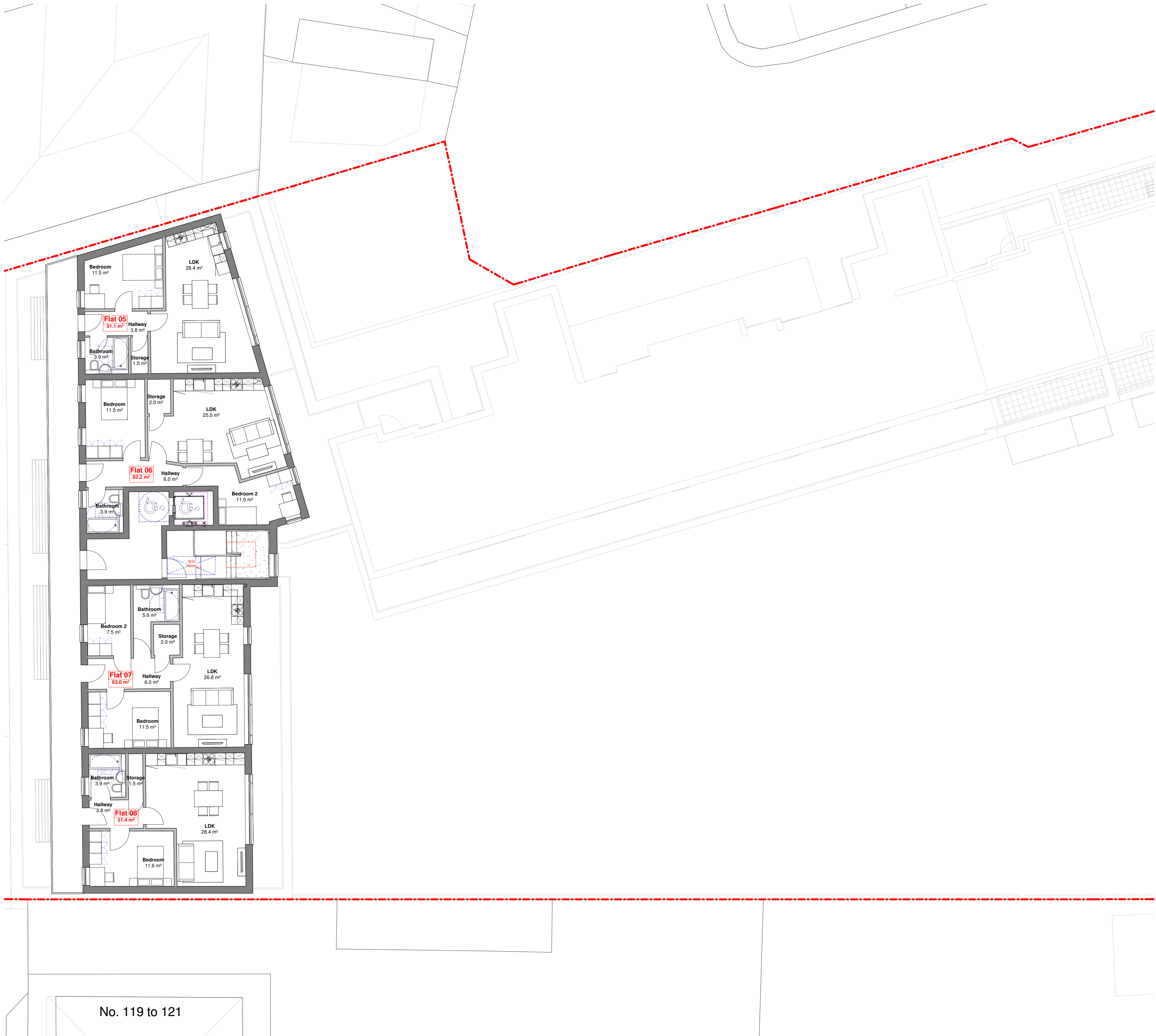
Proposed Fifth Floor - Pinner Side