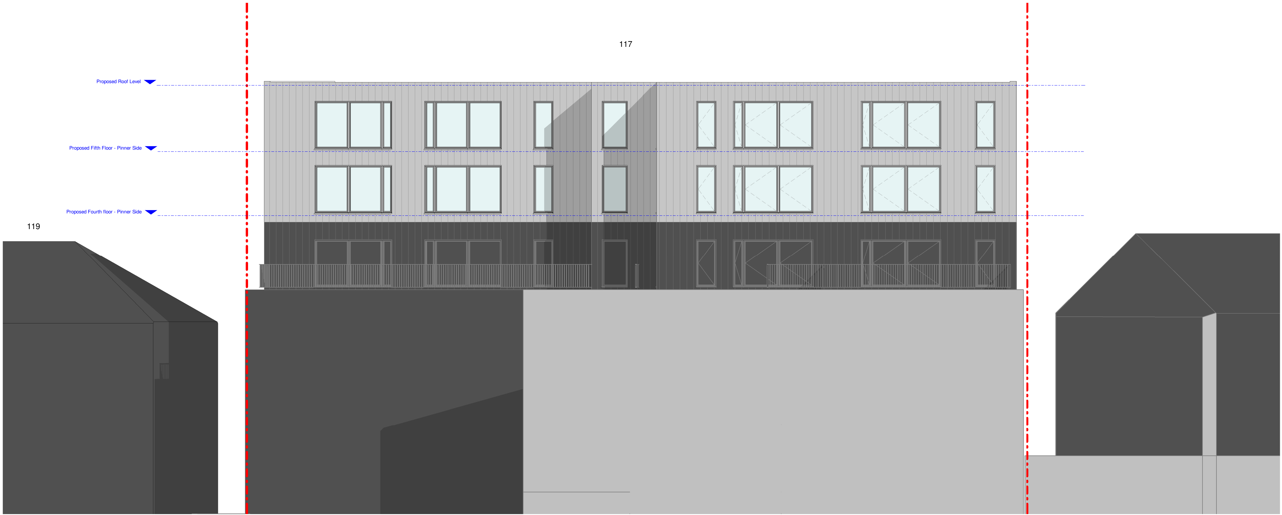
Proposed Elevation Pinner Area - 5