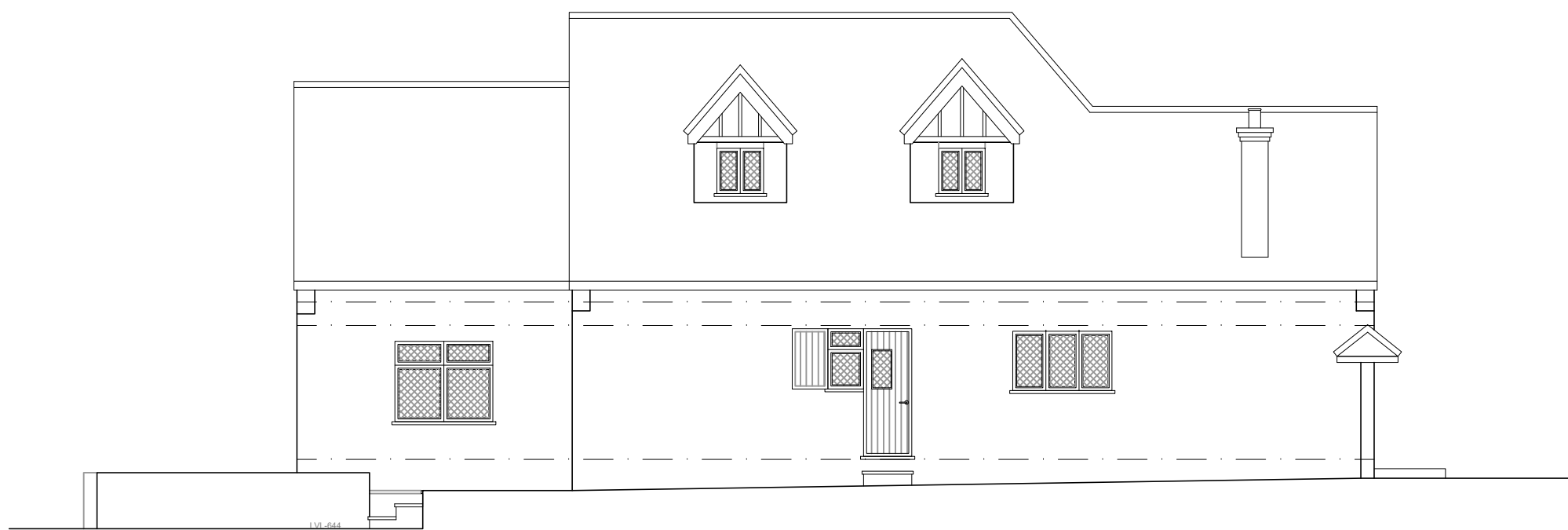
EXISTING SIDE ELEVATION (VIEW FROM THE ROAD) SCALE 1:100