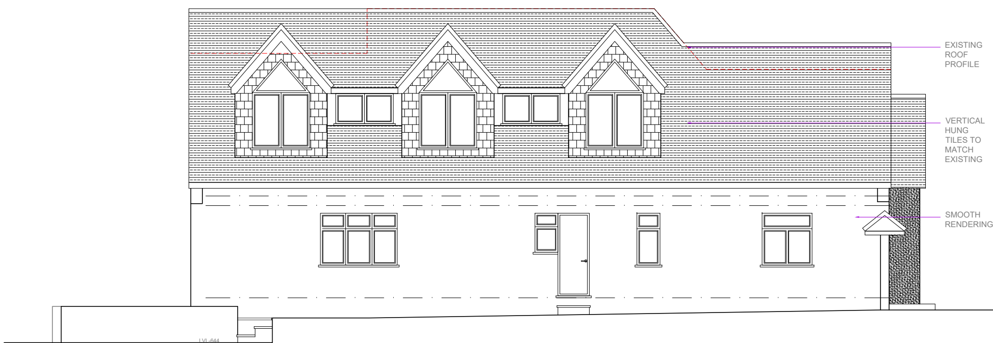
PROPOSED SIDE ELEVATION (VIEW FROM THE ROAD) SCALE 1:100