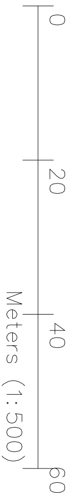
LOCATION PLAN 1:500 A3