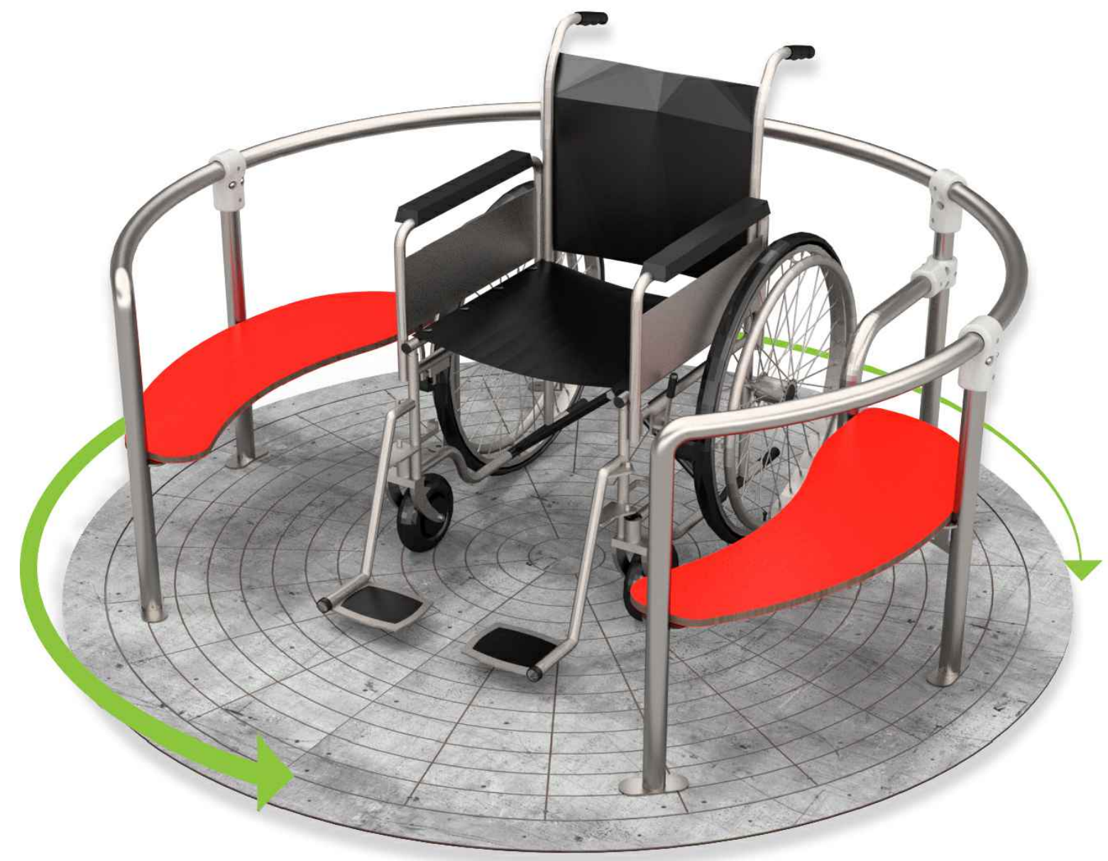
Wheelchair Roundabout - SB3110

EXACT LOCATION OF EQUIPMENT TO BE AGREED ON SITE. ALL SURFACING TO BE FLAT AND LEVEL, ANY DISCREPANCIES IN LEVELS TO BE REPORTED TO MIRACLE DESIGN & PLAY IMMEDIATELY.