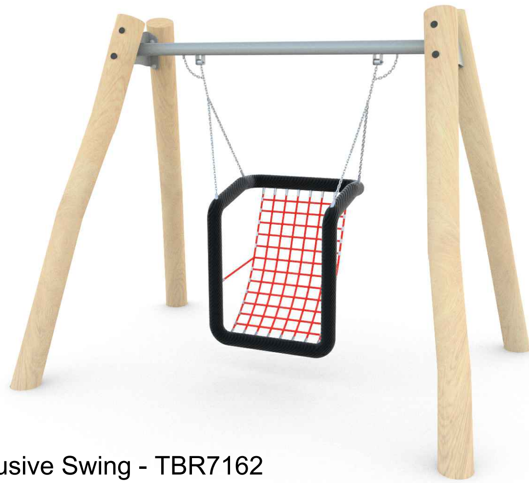
Inclusive Swing - TBR7162