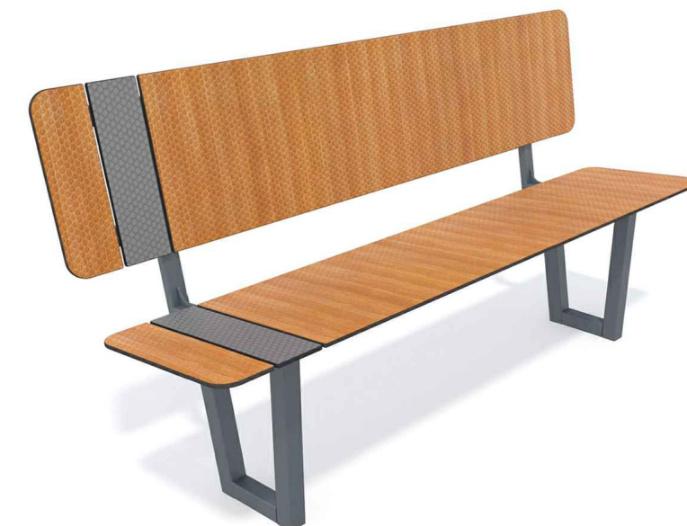
Bench - SB5057