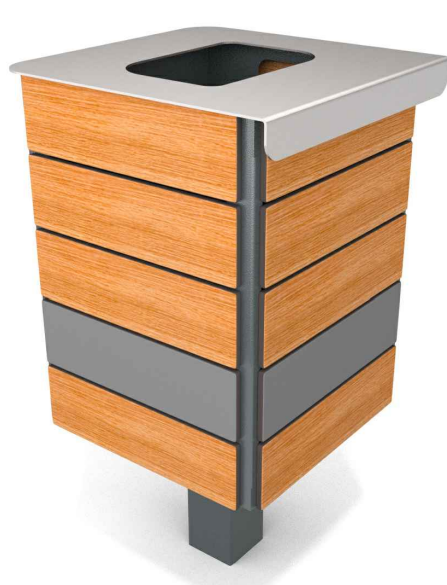
Bin - SB5084