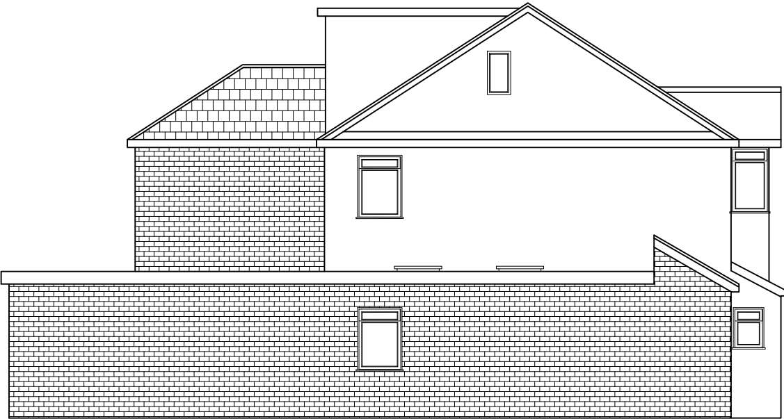
4 Proposed Side Elevation SCALE: 1:100