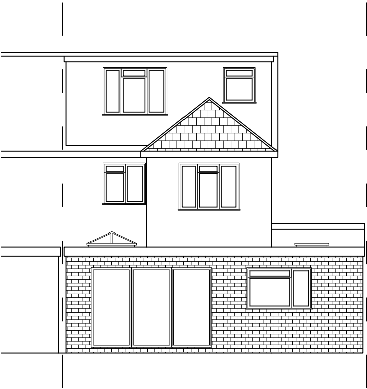
2 Proposed Rear Elevation SCALE: 1:100