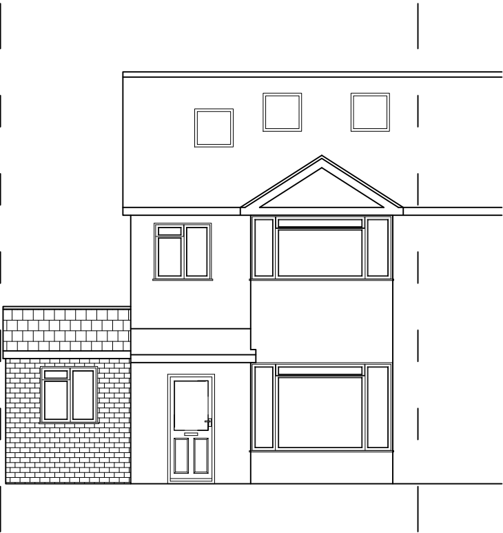
1 Proposed Front Elevation SCALE: 1:100